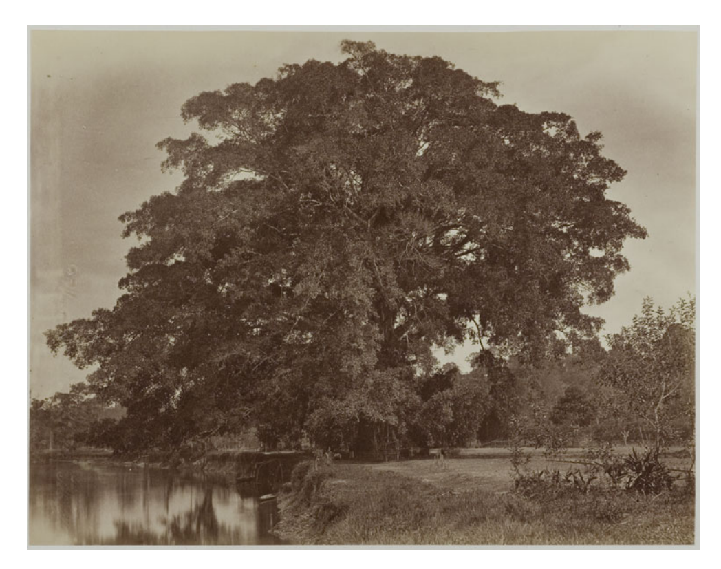
Figure 2. Photograph of a waringin tree in Sumatra, c.1877-79

After the speech Der Kinderen and those gathered planted a new waringin and the penghulu read a prayer.<sup>55</sup> Der Kinderen exclaimed in Dutch and after that in Malay: