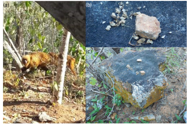
PLATE 1 Blonde capuchin monkeys Sapajus flavius moving on the ground in the Caatinga biome of north-east Brazil (a), along with evidence of their use of hammer and anvil stone tools for opening Manihot epruinosa seeds (b), in the site denominated as ‘tool use sites’ (c).

The first phase of the survey was conducted in July–December 2019 when a group was monitored for 7 days per month. Although other species of capuchin monkeys are known to use tools (e.g. Sapajus libidinosus ; Fragaszy et al., 2004, American Journal of Primatology , 64, 359–366), this behaviour has not been reported previously for the blonde capuchin monkey in the Atlantic Forest. In the Caatinga, we observed sites with evidence of the