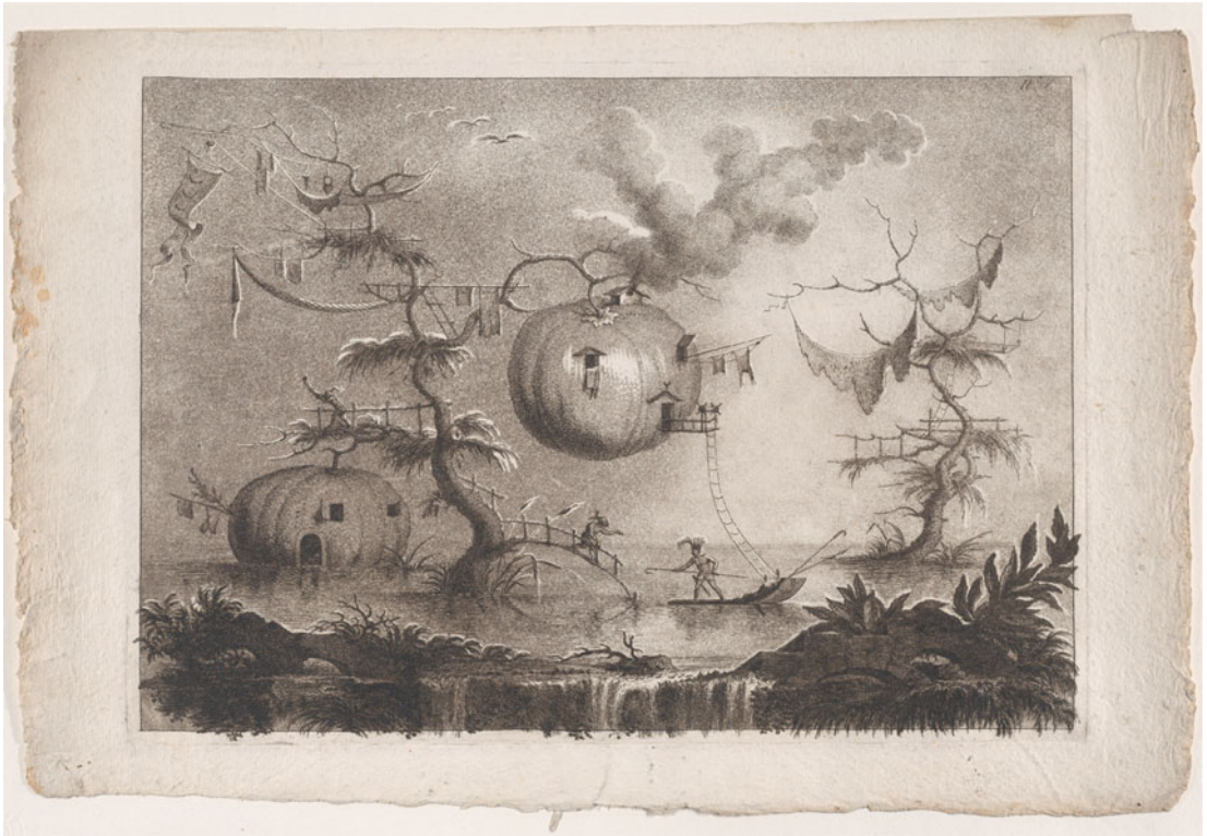
Figure 1. Engraving from The collection of the most notable things seen by John Wilkins, erudite English bishop, on his famous trip from the Earth to the Moon (Morghen, 1783), depicting 'Pumpkins used as dwellings to secure against wild beasts', from https://www.metmuseum.org/art/collection/search/811200 .

straps bottles of dew to his body, and eventually succeeds with a kind of space rocket.