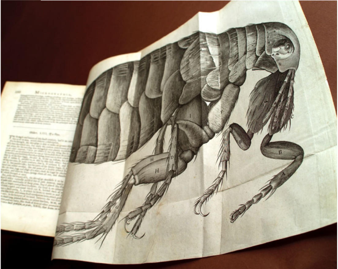
Figure 3. A flea from Robert Hooke's Micrographia , https://commons.wikimedia.org/wiki/File:Robert_Hooke,_Micrographia,_flea_Wellcome_L0043504.jpg .

infinity of universes, each with its firmament, its planets, its earth, in the same proportion as in the visible world; and on this earth animals, and finally mites, where he will find again what he saw before, and find still in the others the same thing without end and without cessation. Let him lose himself in wonders as astonishing in their minuteness as the others are in their extent!