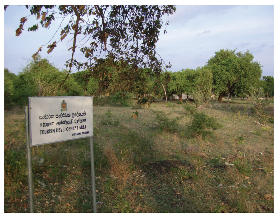
Photograph 5.3 Overgrown tourism zone