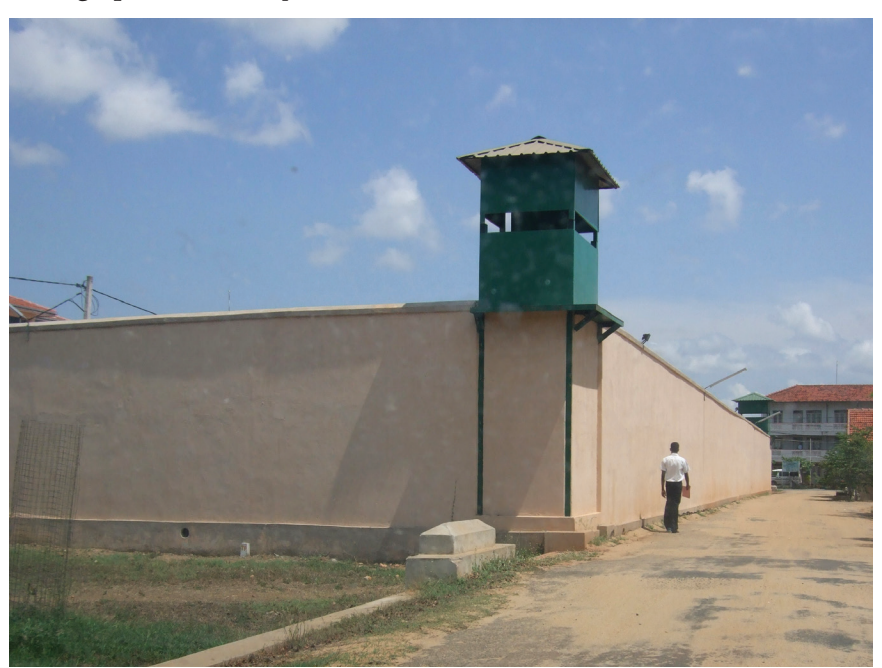
Photograph 5.2 Walled provincial council