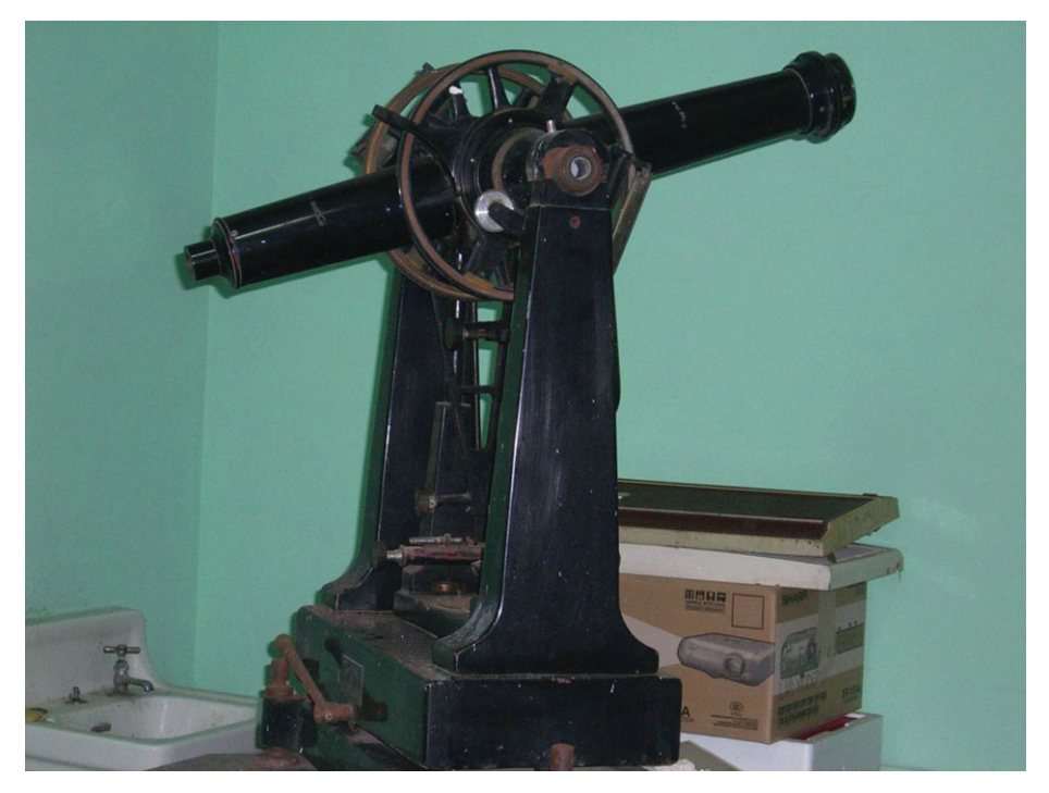
Figure 2. The Meridian Circle.

Astronomy turns out to be a science to which the general public is very much attracted, and it can become the first step into the fascinating world of sciences.