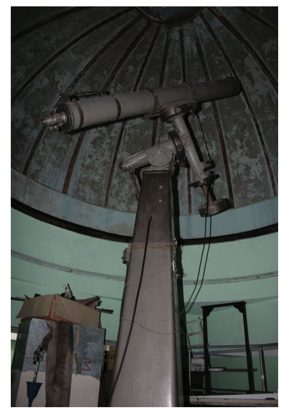
Figure 1. The main 150mm equatorial telescope.

At one time, these studies were suspended and the C Department disappeared, so the observatory was gradually losing its function, until it ended abandoned.