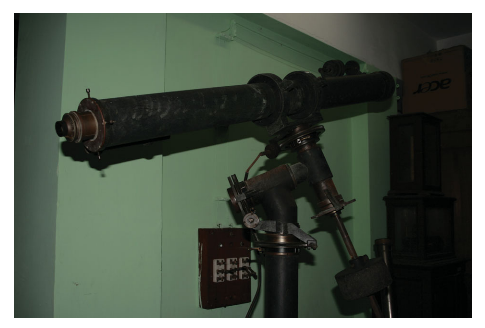
Figure 3. The 95 mm Secrétan telescope.