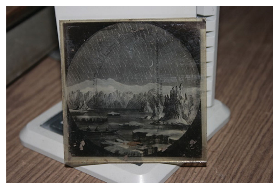
Figure 5. Illustrated glass-plate transparencies.

who has been working side by side for the diagnosis of the technical instruments of the observatory, among others;