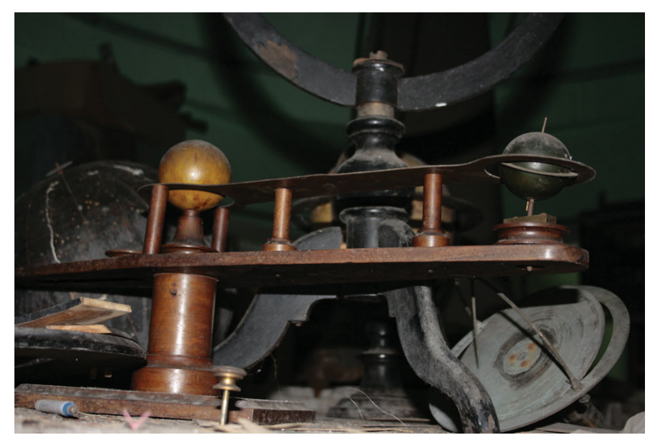
Figure 4. Secrétan scales.

with whom we have been doing some work on diagnosis of the AOUH technical and constructive situation;