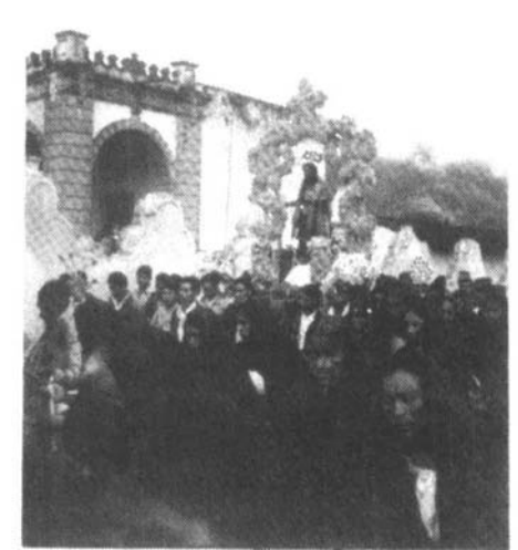
Mayordomia procession for San Mateo 21

MICHIGAN Dept. WB Ann Arbor, Michigan 48106-1104