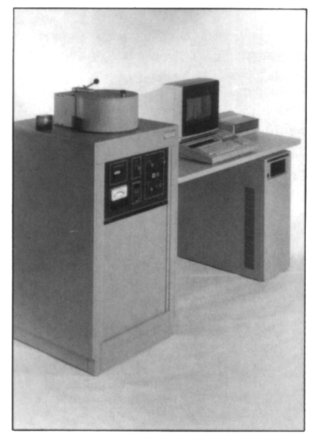
X-Ray Fluorescence Spectrometer System

Superconducting Magnets and Cryogenic Supplies: American Magnetics' catalog contains over 440 standard magnet designs and a full line of power supplies, power supply programmers, liquid helium level meters, and cryogenic instrumentation. Free custom design of superconducting magnets is available.