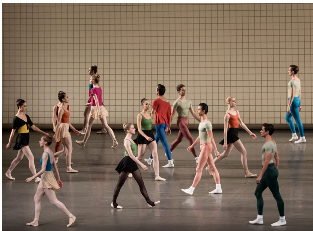
Figure 1. NYCB dancers in the opening section of Glass Pieces . Photographer: Paul Kolnik. Used with permission.

walk haphazardly across the stage. They are dressed in costumes designed by Ben Benson to evoke a combination of practice outfits and low-key streetwear (Figure 1). 35 The corps follow Rainer's plan, rejecting a hierarchical relationship of parts, phrasing, and development, and substituting everyday movement, neutral performance, equality of parts, and uninterrupted movement. They interact very little with the Glass score, and not at all with its pulse. Robbins instructed the dancers to look like commuters in Grand Central Station at rush hour. 36 In my interviews with the original cast, a number of dancers agreed that the experience onstage mimicked the experience of living in New York. In original cast member Jock Soto's words, "It's Times Square, it's the subway, people flying... and all the three thousand people that come to the theater, they're doing the same thing, walking quickly to get to a