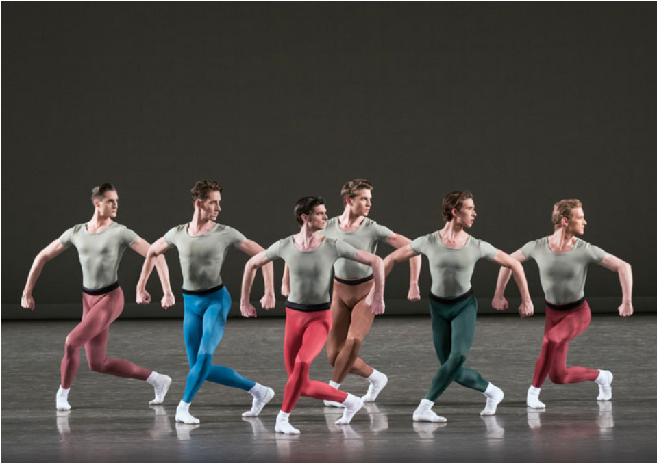
Figure 4. Unusual reference to Egyptian artistic figures in ballet. Note the head tilt to the side, with the torso facing the audience. NYCB dancers in Glass Pieces , section three.

in the second movement. The corps seemed to have appreciated it, particularly the men in the corps, who at NYCB often get much less active dancing than the women. 61