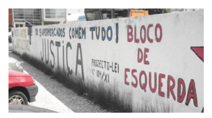
Figure 6. (Colour online) 'Supermarkets eat everything'. Source: 'Market Graffiti' (collection of the author, 2010).

Source: 'Market Graffiti' (collection of the author, 2010).