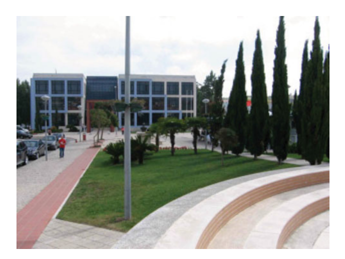
Figure 8. (Colour online) José Máximo da Costa, c. 2008. The new square is open and airy.

a café and a amphitheatre are found in the square), be easily accessible and include trees and other green infrastructure. 82 In 1984 the CML published a 'General Plan for the Urbanisation of Lourinhã'. Along with the District of Lisbon, the CML felt the need to establish an 'instrument that would provide the best possible development of urban space in order to achieve equal development'. 83