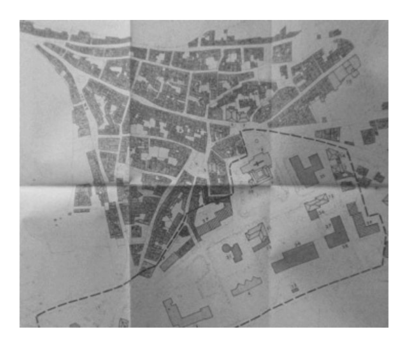
Figure I. Lourinhã's map in 1979 with the proposed area for development outlined. The contrast in the two landscapes is clear in terms of topographical layout, size and space.

This left Lourinhã with a stable socio-economic profile that translated into relative political calm. Not since the 1930s, when Salazar's appointed local administrative commission faced complaints of corruption, has the municipality experienced political upheaval that deserved national attention. Indeed, no major political action either in support of or against any particular government in the twentieth century has occurred in Lourinhã. As a result, the local government has enjoyed stability. The CML's administrative commission, installed during the revolution to replace the dictatorship's appointees, for example, was made up of former dictatorial officials and men who had been accepted participants in political life before 1974. In fact, Lourinhã's pre-1974 mayor returned to the CML as a councillor in the late 1970s. Further highlighting political stability in Lourinhã, citizens have consistently swept the Socialist Party (PS) to power at all levels since winning the ability to elect their representatives.