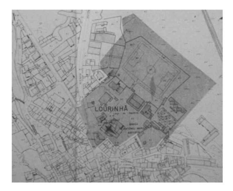
Figure 2. The area that would become the new town centre in the 1970s is highlighted here. Dominated by the town's old soccer field, the area included the old farmers' market. Today, the new square, the Praça José Máximo da Costa, is an open area bounded by the medieval convent (in the map above), a courthouse, a fire hall, a post office, a music academy and the new town hall. The renovation of this space was total.

Source: CML, Plano de Pormenor da Zona Central: Extracto do Plano Aprovado, 1979', Plano Geral de Urbanização da Lourinhã', 1984. Caixa: Plano Geral de Urbanização da Lourinhã (Arquivo Municipal da Lourinhã, PT).