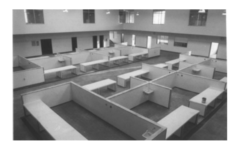
Figure 4. The municipal market shortly before opening in 1989 shows a much more modest and simple plan that, instead of housing some sixty-five stalls and twenty stores, offered twenty stalls and a handful of permanent stores. Today the permanent stores are butchers', cafés and restaurants.