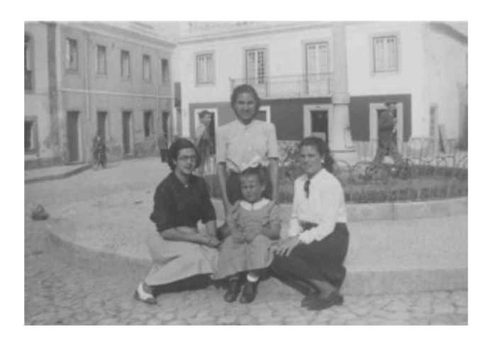
Figure 7. The Praça Marques Pombal, c. 1940. The old square was a cramped parking lot by the time the new one opened in the 1990s.