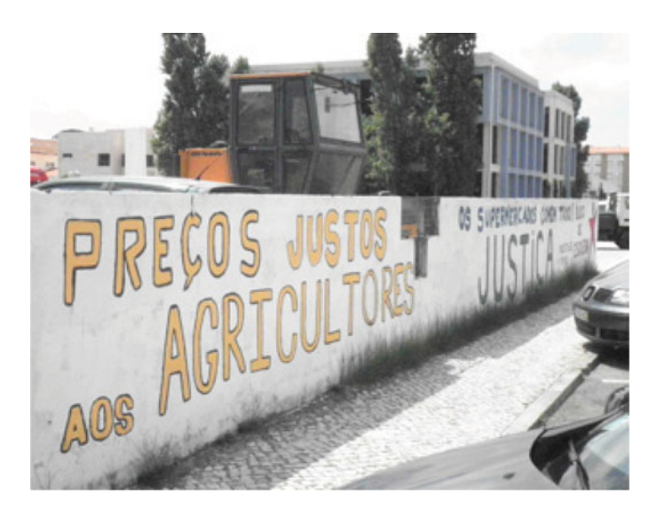
Figure 5. (Colour online) 'Fair prices for farmers'. Although little resistance to Lourinhã's renovation is evident (in fact, locals played an active role in building the town's modern landscape), public space remains a site for protest. The above graffiti, appearing outside Lourinhã's modern market hall in the wake of the financial crisis of the late 2000s, remains there today.