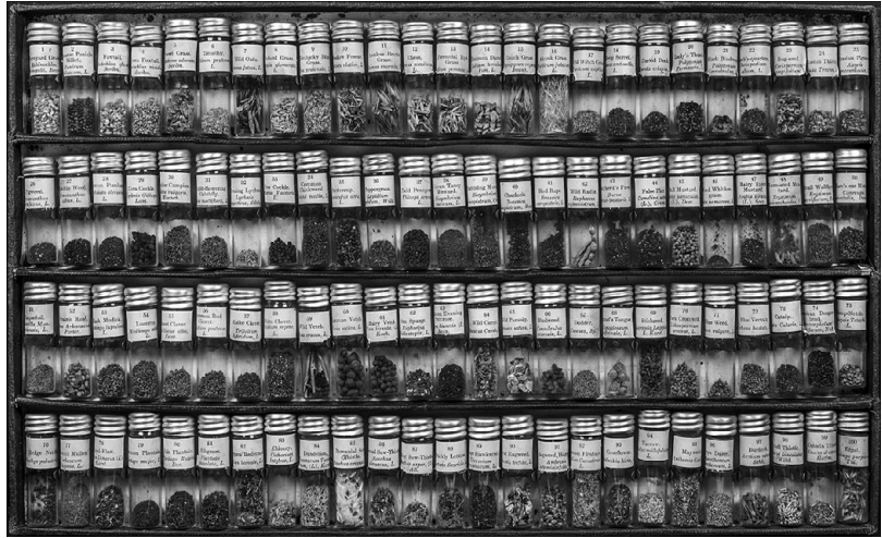
Figure 10.3 This 1906 reference collection of ‘economic plants’ includes both crop and weed seeds of Canada. Reproduced courtesy of the Nova Scotia Museum Botany Collection, Nova Scotia Archives (Harry Piers accession number 3058).

use at agricultural research institutions, including seed-testing stations, would contain examples of agricultural crops as well as weeds, the latter regardless of whether they could be used as source indicators (Figure 10.3). 32 By virtue of including a wide range of plant material, local and global, these herbaria were (and are) suited to dealing with varied needs of researchers and farmers. In contrast, the Whipple’s seed herbarium was tailored to a single task: the identification of a seed’s place of origin.