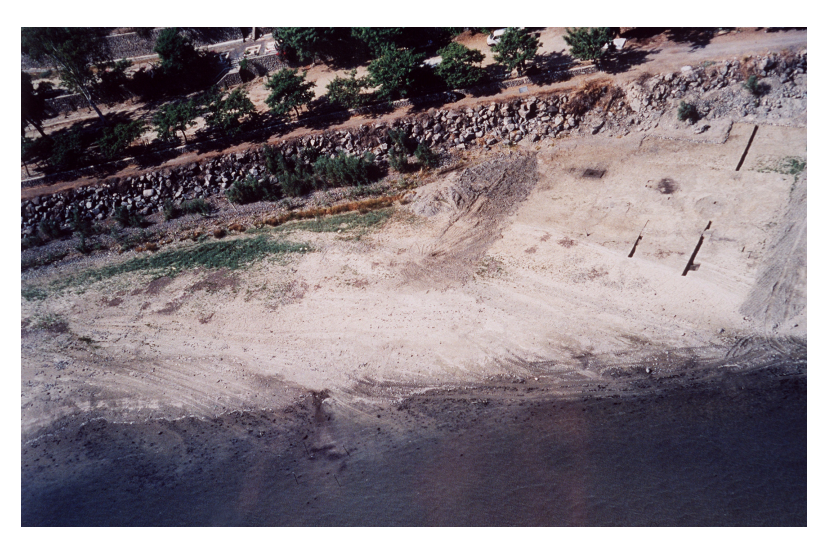
Figure 2 Aerial photo of Ohalo II camp during excavations, looking west. The dark oval areas between the narrow trenches are floors of in situ Late Pleistocene brush huts. Sediments at bottom left are post-occupation. Water level is about –213 m.