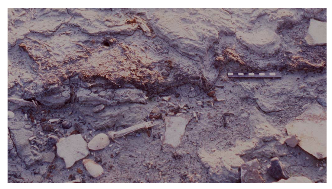
Figure 6 A close-up view of in-situ organic matter in lacustrine sediments at Tel Katsir Beach. Scale bar is 10 cm.

trend. Each water level rise deposited a low-energy cover over the abandoned camp. Thus, the site reflects a time of short water level fluctuations around the –213 m level, and then a high stand long enough to deeply cover the area by additional sediments. Such a rise is evident in the finely laminated layers covering both Ohalo II and Ohalo II South. This event is dated to about 19,500 BP.