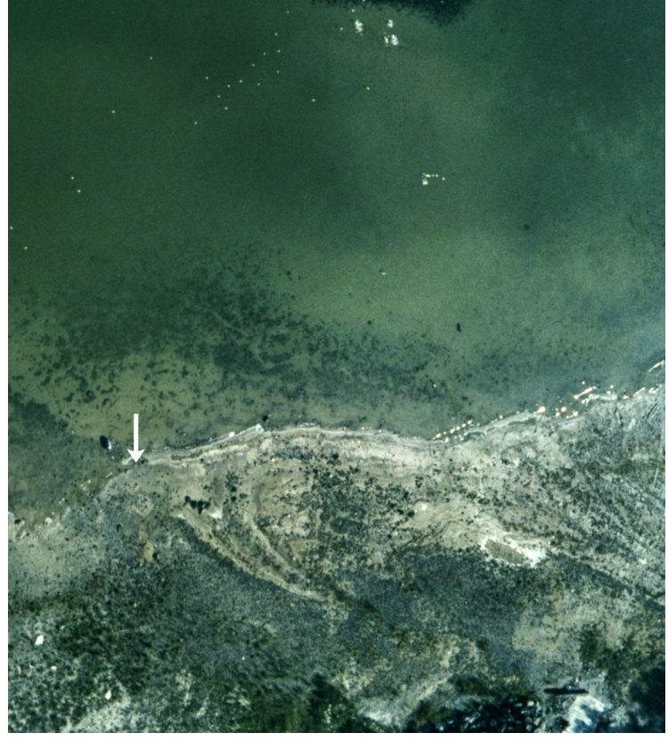
Figure 3 Aerial photo of Beit Yerah Southern Beach, looking east. Water level is about –213 m. The arrow points to the location of the trunks.