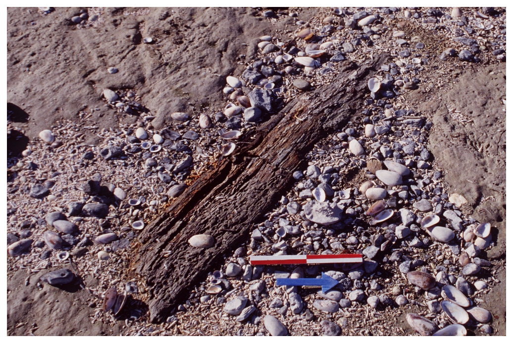
Figure 4 A Salix trunk embedded in Late Pleistocene clay sediments at Beit Yerah Southern Beach. Scale bar is 20 cm..

would probably have decomposed before the later ones would have been deposited. Thus, the facts that they are concentrated (and not visible elsewhere on the beach) and excellently preserved reflect one short depositional episode followed by an immediate water level rise. It is also noteworthy that the trunks do not look like the remains of natural bank vegetation. The absence of other tree parts and other species, and the presence of a gazelle horn core and isolated bones might indicate human intervention here. This can only be tested in future excavations (water levels permitting).