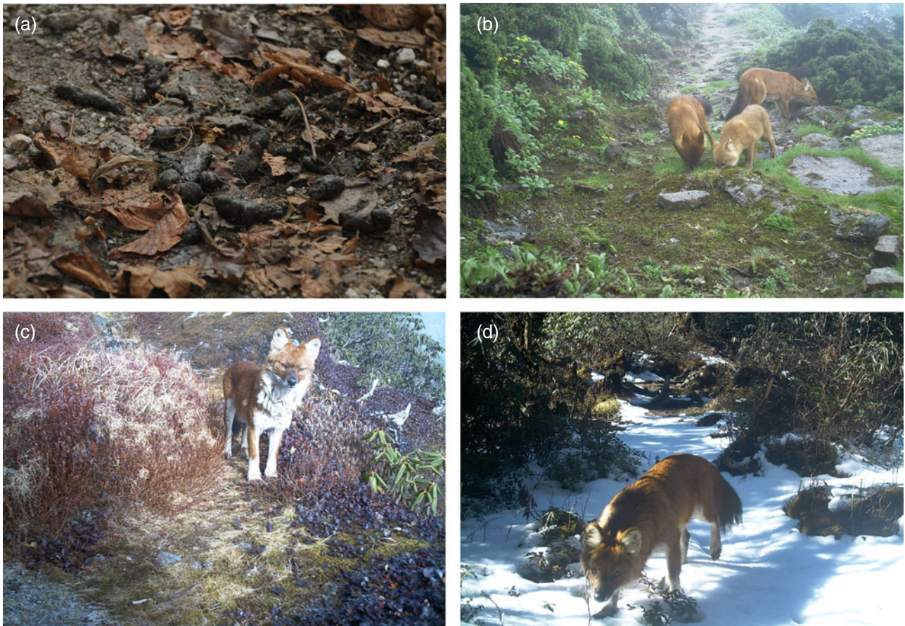
PLATE 1 (a) Dhole Cuon alpinus scats found in a cluster in the middle of a trail in temperate forest in the Prek Chu catchment in Khangchendzonga Biosphere Reserve (Figs 1–2). (b) Dhole pack, with one subadult (in the foreground). (c) Adult individual in subalpine–alpine edge forest. (d) Adult in subalpine forest.