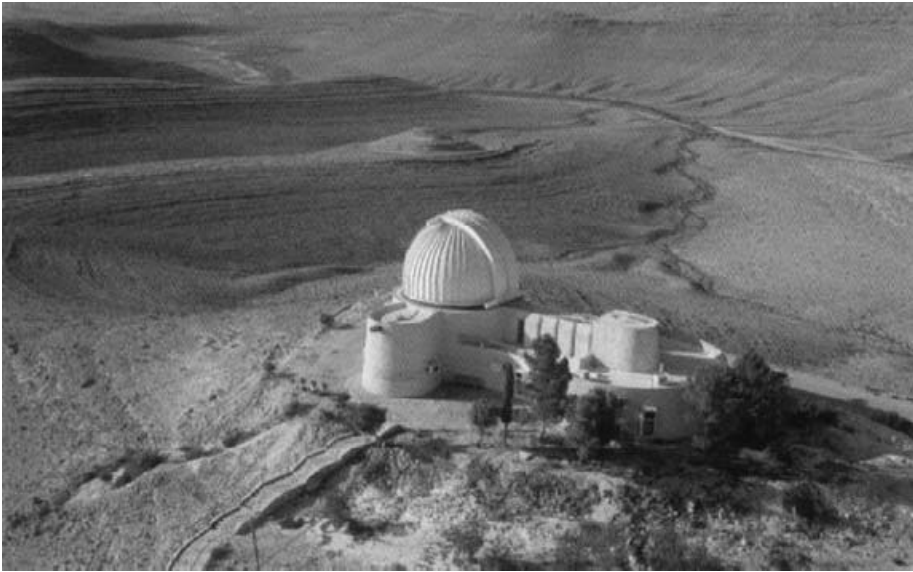
Figure 3. The Wise Observatory in the Negev desert, 200 km South from Tel Aviv, Israel.

of Göttingen, Germany. The network of these two telescopes will increase the number of measurements, enhancing the expected number of planets. Dozens of transiting extra-solar planets are expected to be found over the three year observation campaign.