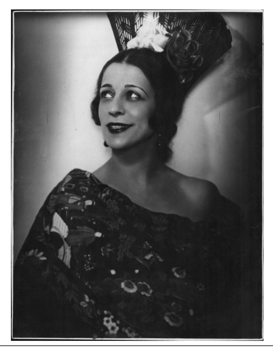
Photo 7. Antonia Mercé La Argentina with a Manila shawl, 1928.

Through such processes of appropriation under the colonial gesture, La Argentina created a repertoire of "Hispanic essences" that constructed a postcolonial "community," equivalent to the rock-hard monumentality of a Hispanidad—the commemoration through Columbus statues and colonial architecture—now celebrated from the body, its performativity, its symbolism, and its gesture, and that marked a turning point in the use of the political power of Spanish dance from the 1930s. While this was exploited by the leftist republican government, the narrative of a Hispanidad based on traditionalism, the Catholic substrate, and more conservative leanings was operationalized within the rise of Fascism. The work of Fascist writers such as Ramiro de Maeztu (1934) would eventually be exploited during the Franco dictatorship, and the Hispanidad policies would mark other avenues of international diplomacy with countries such as Perón's Argentina, when the regime was isolated from other surrounding countries in the postwar period. The recognition of La Argentina by the Spanish republic could thus paradoxically be understood as one of the first precedents in an emergent Spanish cultural diplomacy based on this Hispanic community, later taken to the extreme with the tours of the Coros y Danzas