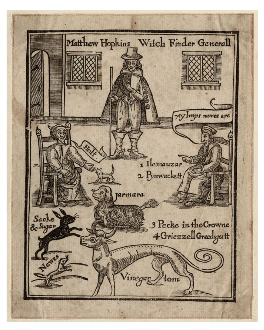
Fig. 1. Unknown artist, Matthew Hopkins, woodcut, 1647, © National Portrait Gallery, London, https://www.npg.org.uk/collections/search/portrait/mw134815/ Matthew-Hopkins.

24. 'Matthew Hopkins,' Encyclopedia of occultism and parapsychology, 2001, Gale in Context: Biography.