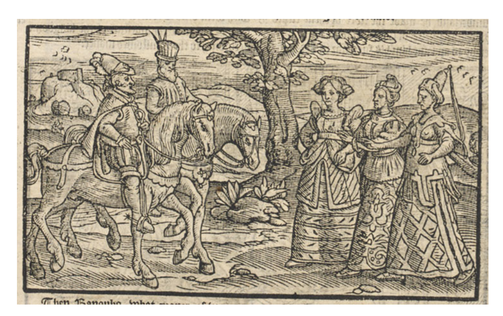
Fig. 6. Unknown artist, 'Macbeth, Banquo, and the Three weird sisters,' woodcut, 1577, from The firste volume of the chronicles of Englande, Scotlande, and Irelande, British Library, London, https://www.bl.uk/collection-items/holinsheds-chronicles-1577

The value of entering into a primary text—a 'pre-adaptation' of Shakespeare's play—using students' developing visual literacy skills coupled with the QFT inquiry model became clear in the discussion of this particular woodcut. Students felt empowered to ask questions, regardless of their relevance or importance. Pivotal to a meaningful and robust research process is the ability to ask questions based on the evidence that lies before the researcher's eyes, and to then cue the research process from there.