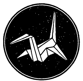
The richness and complexity of human life... lived in different ways... in different places... explore them in texts from HRW