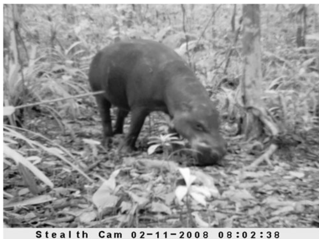
PLATE 1 Camera-trap photograph of Choeropsis liberiensis in Sapo National Park (Fig. 1).

To optimize survey design for estimation of change in occupancy, or to calculate density of the pygmy hippopotamus, the grid size used should maximize the likelihood of encounter. An ideal grid to track changes in occupancy would have cells with an area approximately equal to home range size, such that changes in the population would generate changes in the proportion of area occupied (MacKenzie et al., 2002). Average home range for C. liberiensis is estimated to be 0.4–0.5 km 2 for females and 1.5 km 2 for males (Roth et al., 2004). Confirmation of pygmy hippopotamus home range sizes using radio telemetry would help guide the optimal grid size for measuring change in occupancy, which would provide an index of any change in abundance (O'Brien et al., 2010). If cells are smaller than average home range then the measure is a measure of intensity of habitat use (Royle & Nichols, 2003).