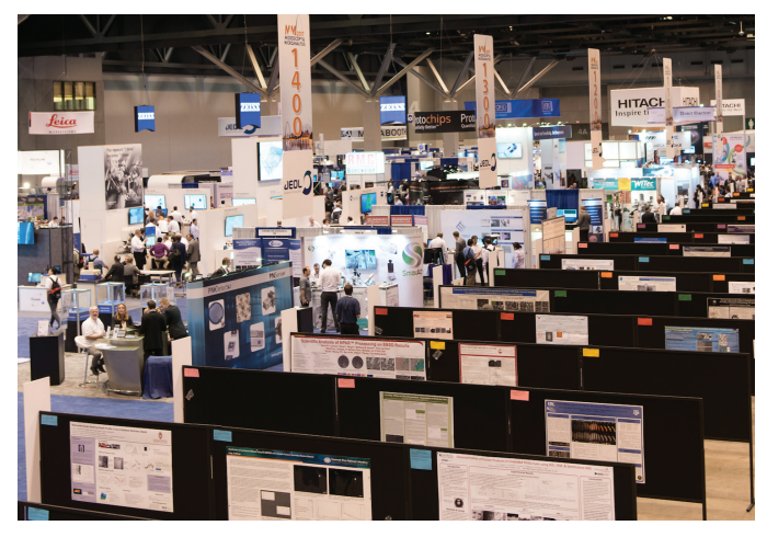
A portion of the exhibition with posters in the foreground.

There were four well-attended pre-meeting congresses. On Saturday, the inaugural Pre-meeting Congress for Early Career Professionals in Microscopy and Microanalysis was presented by the MSA Student Council. The other three pre-meeting events took place on Sunday: "Focused Ion Beam