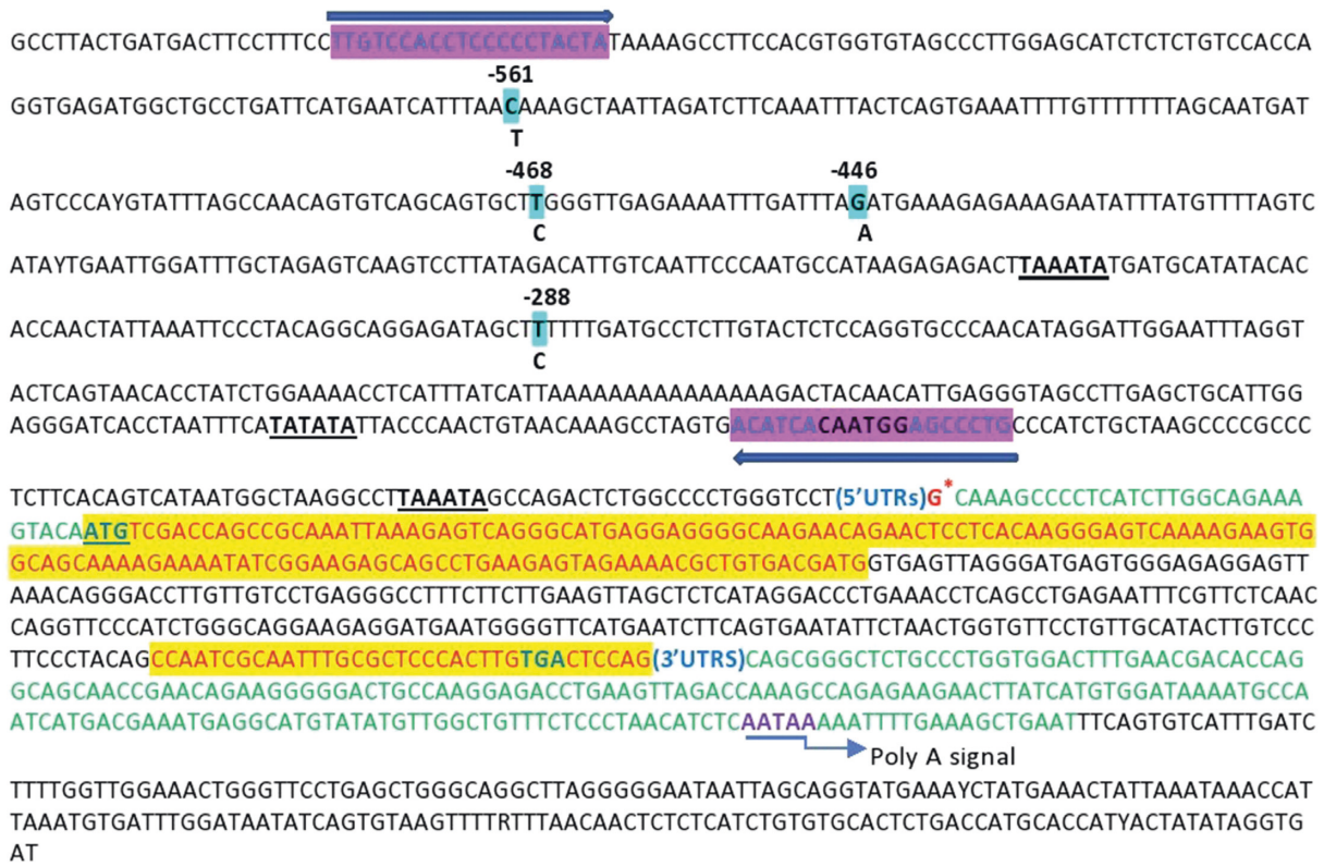
FIGURE 1: TNPI genomic DNA sequences and primers for PCR amplification and sequencing. The recognition site nucleotide sequences, i.e., TATA box nucleotide, are highlighted. Shaded letters represent single SNPs, while minor alleles are noted beneath the nucleotide. The transcription start site is shown with an asterisk. The arrows above and below the DNA sequence represent the primers employed for polyA-additional signal PCR amplification (the polyA signal from the straight arrow is added to the TNPI mRNA). Yellow areas represent exons in the TNPI gene.