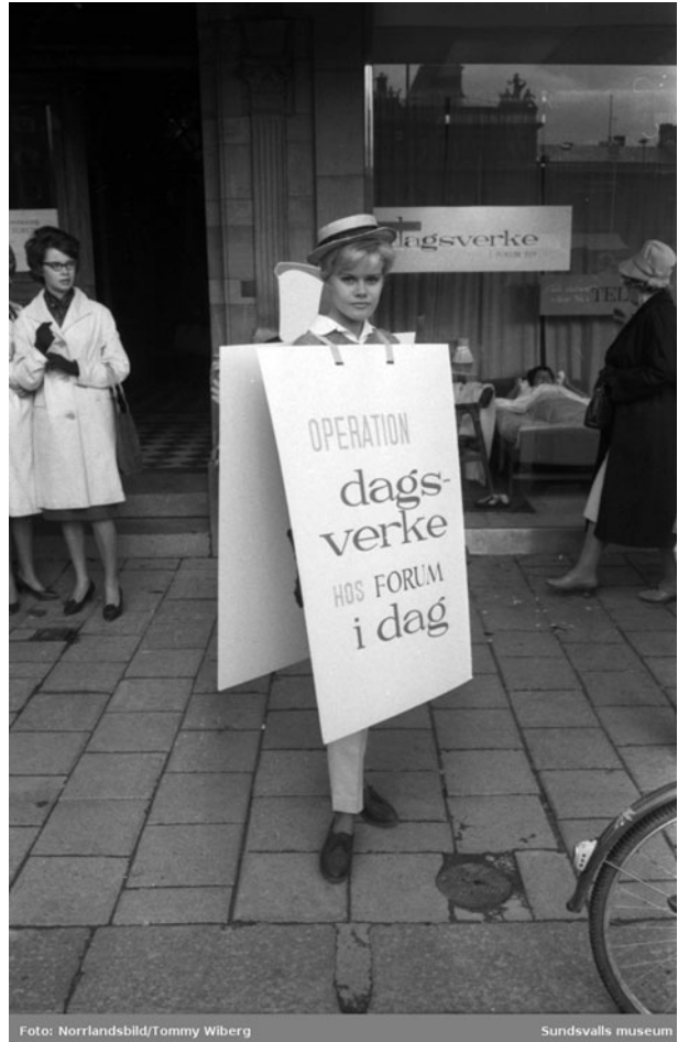
Figure 1. Student supporting the OD campaign in Sundsvall, 15 September 1961.

name, meaning ‘day’ in Swedish), where participants also donated one day’s earnings to the Dag Hammarskjöld Foundation. 59 Later that year, Sveriges Ungdomsorganisationers Landsråd , the National Council of Swedish Youth Organisations (SUL), announced its plans for a national Operation Day’s Work campaign, adopting the Alnarp students’ slogan. 60 In the end, the campaign made use of the mottos ‘En dag för Dag’ and ‘Operation Dagsverke’, citing the latter as the preferred method of fundraising. 61 In December 1961, SUL distributed a call for this nationwide fundraising campaign to all its member organisations, stating that Swedish youth looked to the legacy of Hammarskjöld and his ‘super-human contributions’ as an inspiration. It urged members to donate one day’s salary to the fund. 62