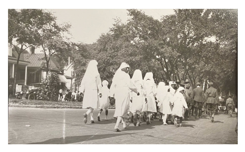
Figure 4. African American soldiers and Red Cross women taking part in a post-war parade in Wilmington, North Carolina on March 29, 1919. World War I Files, Lower Cape Fear Historical Society, Latimer House, Wilmington, NC. Used courtesy of the Lower Cape Fear Historical Society.

The establishment of separate areas of work for women in North Carolina mirrored those of their national level counterpart in Washington, DC. Reilley pushed to more comprehensively leverage women to participate fully in the mobilization at the state level,