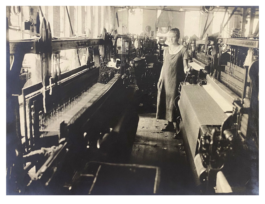
Figure 8. A North Carolina woman working a machine in September 1918 to weave jerkin linings for soldiers at a local woolen mill in Leaksville, North Carolina. North Carolina State Archives, Military Collections, WWI 4, Box 1. Used courtesy of the North Carolina Department of Natural and Cultural Resources.

The final area in which the Woman's Committee was most constrained in their activities was their work relating to the federal government and work outside the home. These two areas, typified by the liberty loan drives and women in industry, respectively, were largely taken out of the hands of the Woman's Committee and managed by federal agencies.<sup>113</sup> In the case of Liberty Loans, the Treasury Department created their own administrative structure to solicit participation in the three drives conducted during the war. This pushed aside the Woman's Committee while still using their connections in North Carolina to mobilize support on the ground.<sup>114</sup> However, while white women felt circumvented by this approach, Black women were able to organize themselves to have a sizeable impact by selling War Savings Stamps among African-Americans in the state, even integrating into county-wide efforts by white citizens to raise money for the war.<sup>115</sup> [Figure 8]