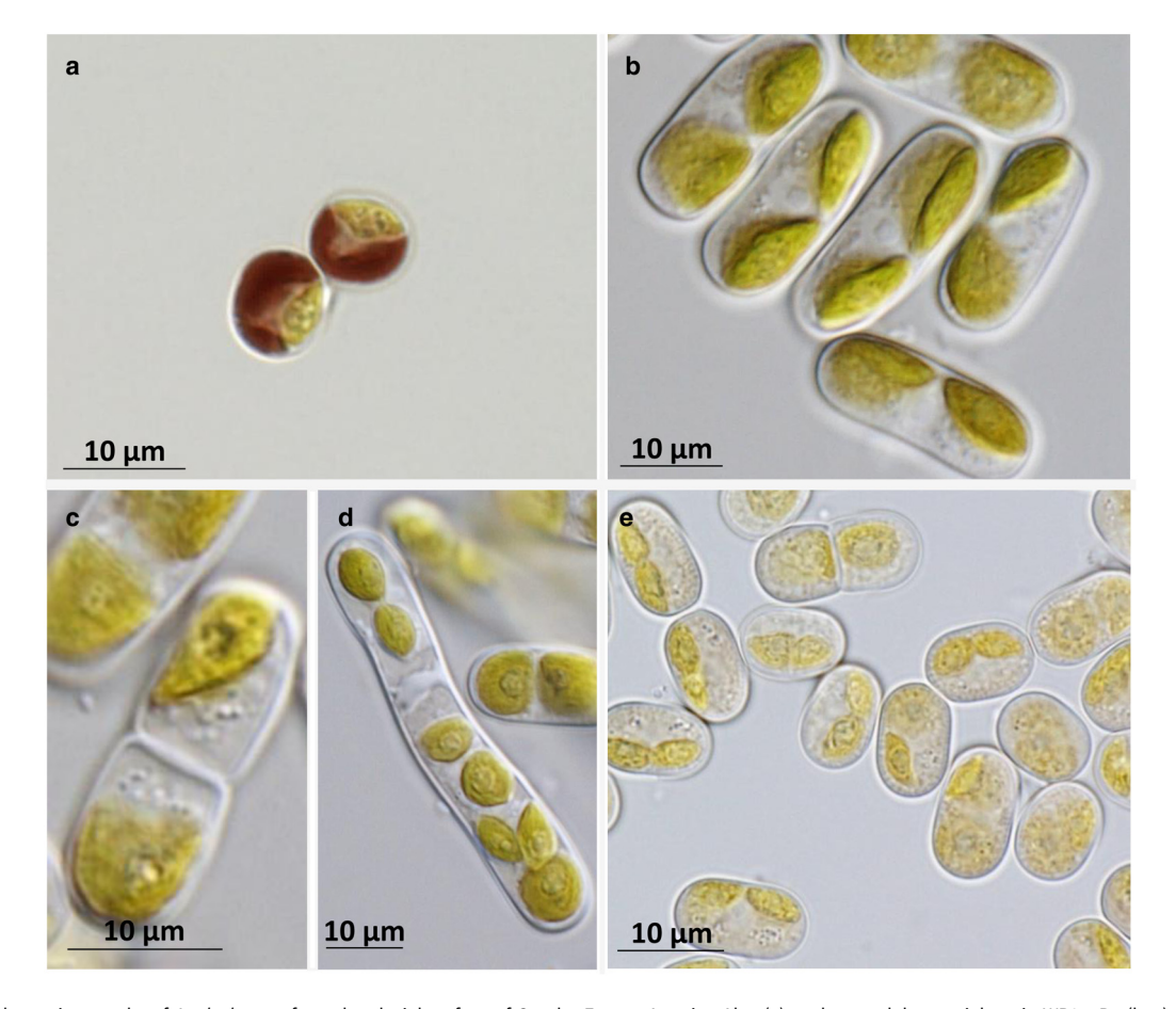
Figure 1. Light photomicrographs of A. alaskanum from the glacial surface of Gurgler Ferner, Austrian Alps (a) vs the new laboratorial strain WP251B1 (b–e). (a) A field sample showing two young cells, each with one chloroplast and prominent brownish (phenolic) vacuoles. (b) Representative strain cells with two shovel-like, parietal plastids, a central nucleus and non-pigmented vacuoles. (c) Occasionally, strain cells with only one chloroplast per cell were observed. (d) Distorted, elongated cells with an abnormal higher number of chloroplasts occurring in an ageing culture. (e) Cells exposed to 200 \mu mol PAR m<sup>-2</sup> s<sup>-1</sup> for four weeks show signs of vacuolar re-pigmentation.