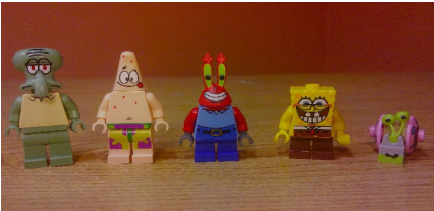
Fig. 1. Introduction slide.

and objects, children saw the same picture set ( n = 4 sets) four times, randomized as described above, each time hearing a different sentence. Figure 2 depicts an example picture set with the characters Spongebob and Patrick.