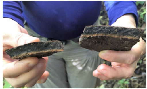
Figure 2. Potsherds found on the surface near the edge of the control site. (Color online)

A forest inventory can reveal the anthropogenic influences on a landscape. In the Amazonian context, a forest inventory involves collecting all species greater than or equal to 10 cm in diameter at 1.3 m up from the ground level (called DBH) and then determining the frequency, density, and dominance of known disturbance indicators (e.g., Anderson and Posey 1989; Balée and Campbell 1990; Peters et al. 1989). The usual size of the forest inventory in Amazonia is 1 ha (ter Steege et al. 2013), although up to 3 ha were sometimes inventoried in the past to show asymptotic species/area curves: the amount of area needed in an alpha-type zone to accommodate the maximum or near-maximum number of species. It has also been suggested that most diversity can be sampled with highly linear inventories, such as 10 \times 1,000 m or 10 \times 3,000 m (e.g., Campbell et al. 1986).