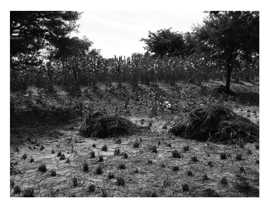
Figure 1. Example of farmers' management of crop diversity within a heterogeneous field in the Maradi region, Niger. Sorghum, tobacco, rice and trees are planted to exploit different niches within one field.