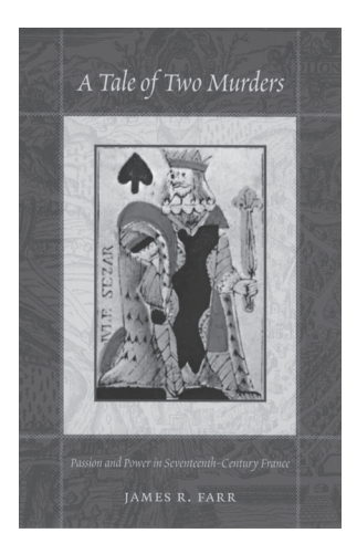
A Tale of Two Murders Passion and Power in Seventeenth-Century France IAMES R. FARR

A Tale of Two Murders is a gripping account of the "Giroux affair"—two murders allegedly committed in 1638 by Philippe Giroux, a judge in the highest royal court of Burgundy—and of the trials which followed.