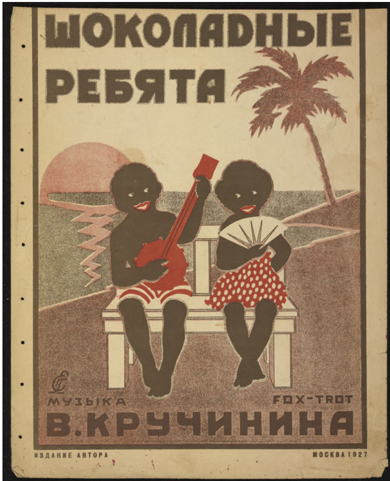
Figure 1 Front cover of Valentin Kruchinin's 'Shokoladnyye rebyata' ('Chocolate Kiddies'). Moscow: Izdanie avtora, 1927.

music to the status of high art. 37 But in autumn 1923, eccentric dances, foxtrots in particular, began to face a severe backlash, particularly by the Proletkult press and by cautious political