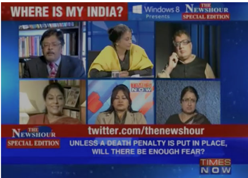
Figure 3. "The Newshour Debate: Justice through Death Penalty," December 19, 2012. https://www.youtube.com/watch?v=nm1ampGOqqk