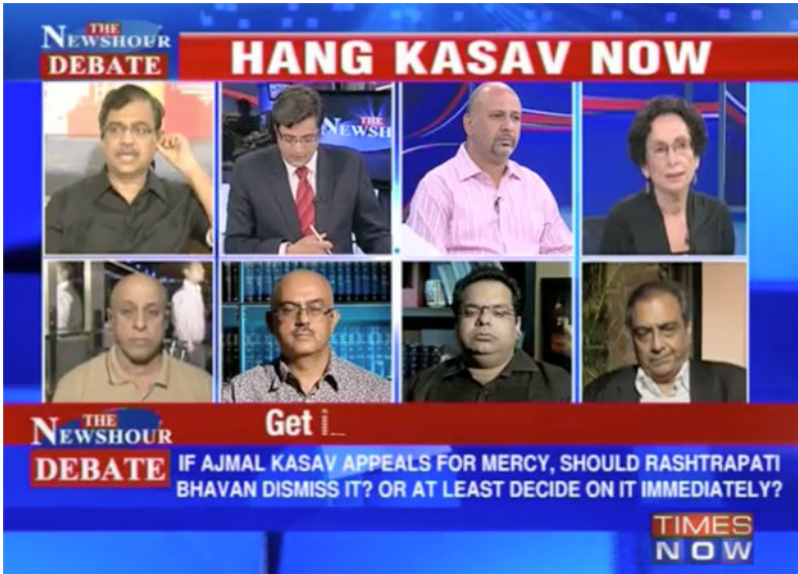
Figure 2. "Newshour Debate: Death for Kasav," August 30, 2012. https://www.youtube.com/watch?v=FPjrC45nRfQ