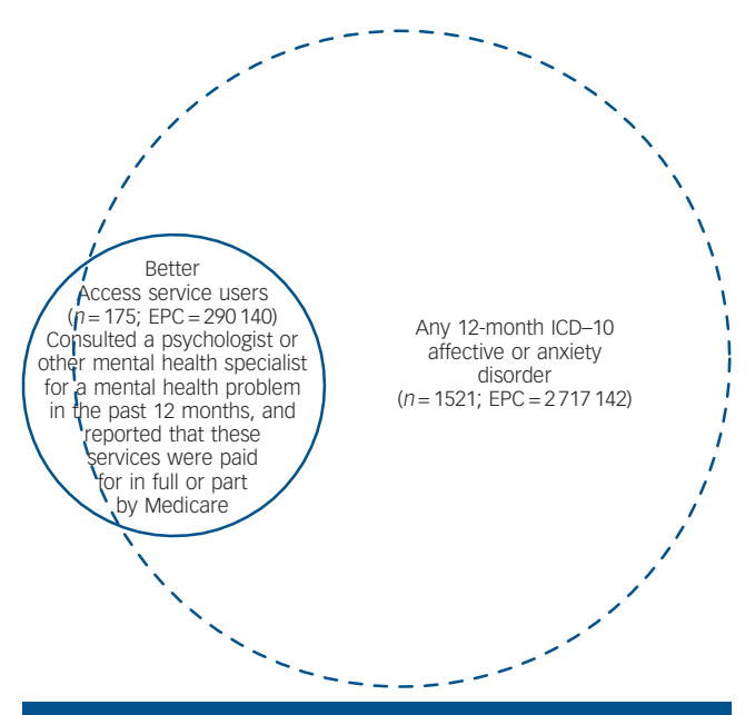
Fig. 1 Overlap between Better Access psychological services users and the community sample with any 12-month ICD–10 affective or anxiety disorder.

A greater proportion of Better Access users with 12-month ICD-10 affective or anxiety disorders received 10 or more