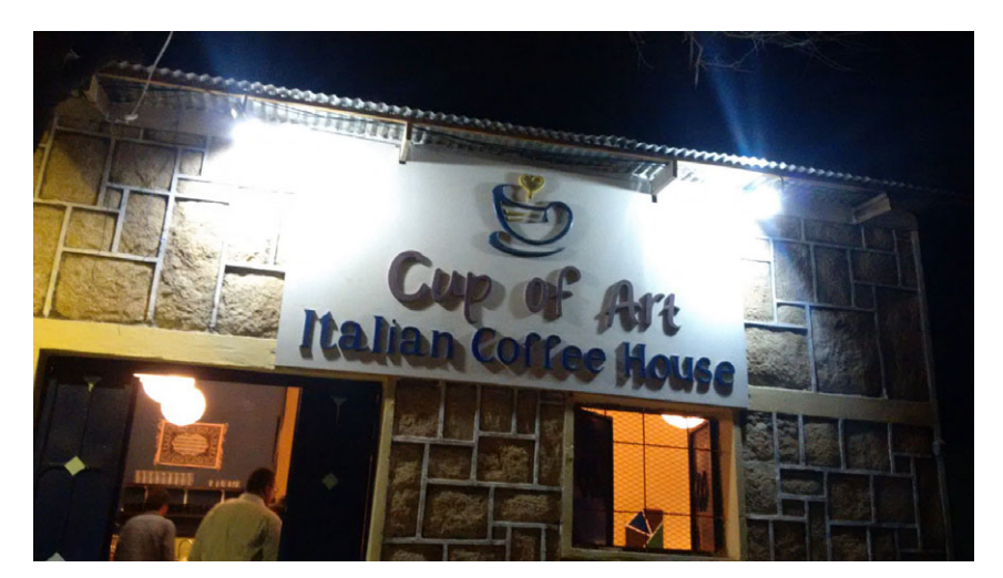
Figure 3. Night lights at Cup of Art Italian Coffeehouse, located in the Shacab area.

I will discuss three distinct but related features and performative practices that defined Cup of Art as a rebel coffeehouse in Hargeisa. The first was its name and outward appearance. As discussed above, its sub-name—Italian Coffeehouse (in British-colonized Somaliland)—was rebellious enough, as it referenced the difficult history of the country, especially with the nemesis