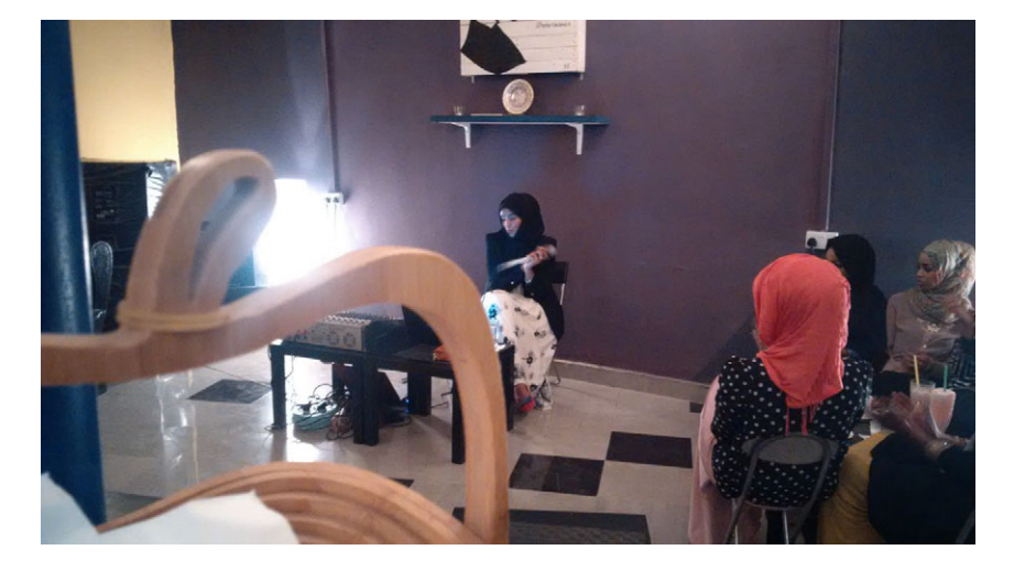
Figure 1. Above: A poet reads before an audience at Cup of Art Italian Coffeehouse, August 2015.

guidance on what one might imprint on the board. It signalled either a longing for freedom of speech and expression or a celebration of creativity, identity, and belonging [see Figure 2 below]. Like that board, the coffeehouse offered other avenues for creative expression in events such as English poetry night, fashion nights (especially for female patrons), and quiz night. Responding to public demand, the café later diversified its poetry platform, adding Arabic Poetry Night and Somali Poetry Night.<sup>1</sup>