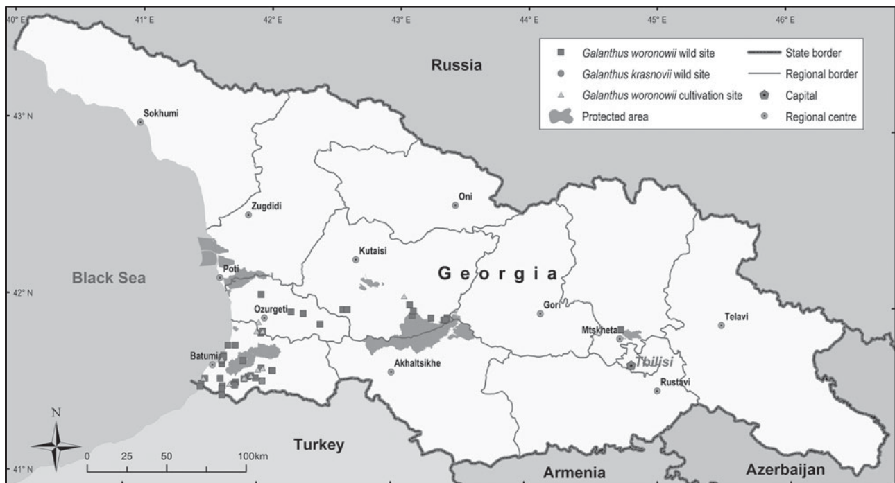
FIG. 1 Locations of the wild and cultivated populations of Galanthus woronowii surveyed in this study.

international CITES community for over a decade (Supplementary Material 1 gives a detailed historical background of international trade in Galanthus spp. from Georgia). It was reported at the International Expert Workshop on CITES Non-Detriment Findings (CONABIO, 2008) that neither a formal management plan nor an effective monitoring system had been established to ensure sustainable trade and conservation of wild populations (Kikodze, 2008). Here we outline the results of the CITES Significant Trade project that was formally commissioned to address the concerns of the international CITES community (Kikodze et al., 2009; PC, 2011).