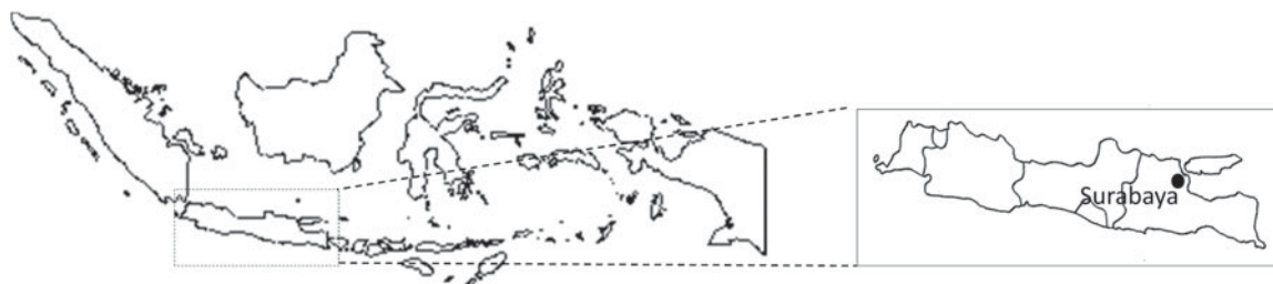
Fig. 1. Geographical map of Surabaya.

a multi-ethnic society with more than 1000 ethnic and sub-ethnic groups delineated by the Wallace Line, a faunal boundary that separates the ecozones and organisms of Asia and Australia. The age-standardized incidence rate of gastric cancer in Indonesia was reported to be 2.8/100 000, which is relatively low among Asian countries (International Agency for Research on Cancer; GLOBOCAN2012, http://globocan.iarc.fr/ ). Although the prevalence of H. pylori infections in Indonesia has been investigated, the reports are controversial and contradictory (0–68%) [4, 5]. In addition, to our knowledge, no report has examined H. pylori virulence factors in Indonesian strains. Therefore, it remains unclear whether the low incidence of gastric cancer in Indonesia is due to low infection rates or low H. pylori pathogenicity. In this study, we examined the H. pylori infection rate in a Surabaya hospital using five different tests. We also identified and analysed virulence factors in Indonesian H. pylori strains.