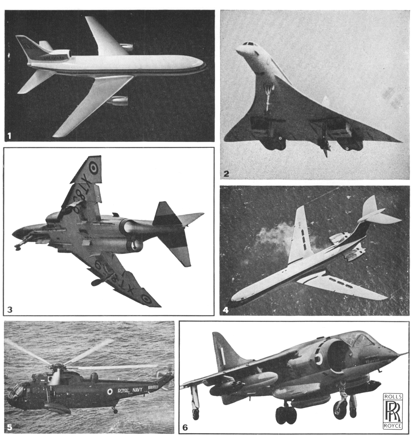
ROLLS-ROYCE LIMITED · DERBY · ENGLAND · Aero Engine Division · Bristol Engine Division · Small Engine Division

Some of these aircraft are shown below. 1. Lockheed L.1011 TriStar—RB.211 2. Concorde—Olympus 593. 3. McDonnell Douglas Phantom—Spey 4. VC10—Conway. 5. Westland Sea King—Gnome 6. Hawker Siddeley Harrier V/STOL—Pegasus.