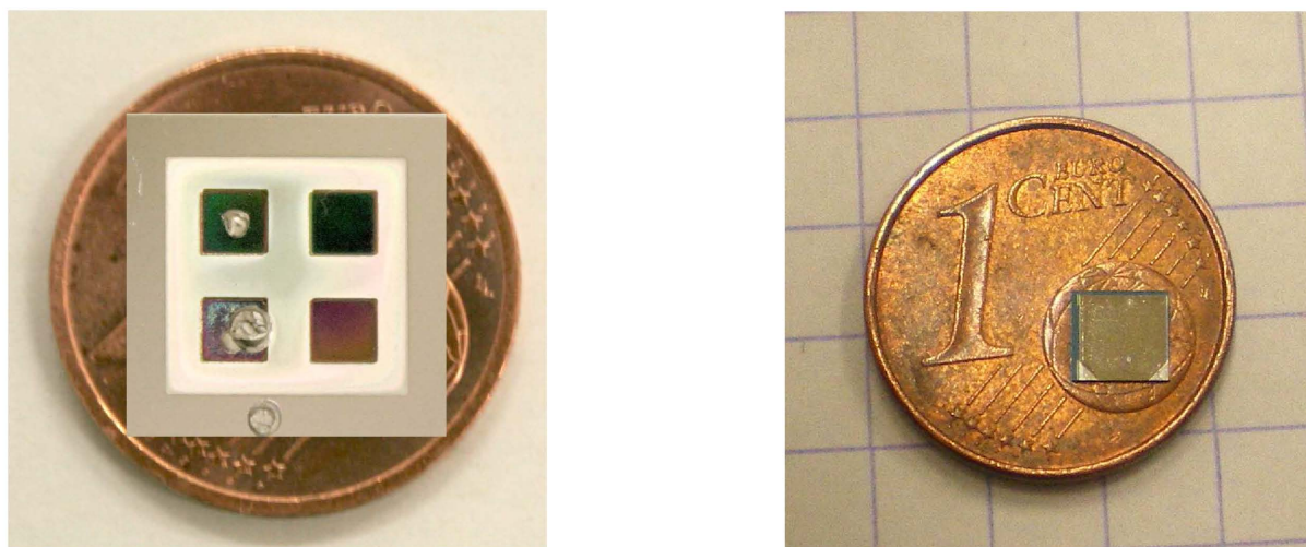
FIG. 1. Pictures of 4 home-made (left) and one commercial (right) microbatteries