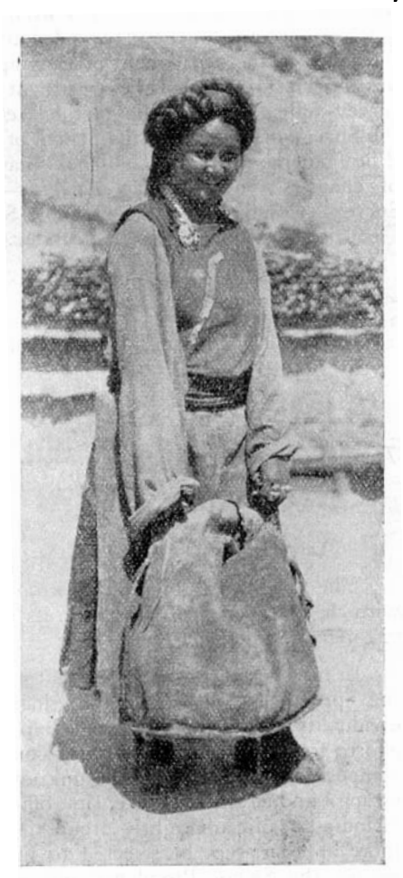
A Tibetan girl of A-tun-tsi

advance and retreat by turns, two steps and a kick, singing a not unmusical chorus—a most delightful parody of 'Here we go gathering nuts and may '."