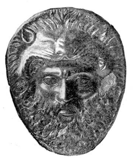
Fig. 58. Chmyrëva Mogila. Golden harness adornment. 1.

Though the geographical limits have confessedly been dictated by considerations of language, yet the frontier of Russia towards the Carpathians and the Danube answers nearly to a real historicogeographical boundary, the western limit of the true steppe. The