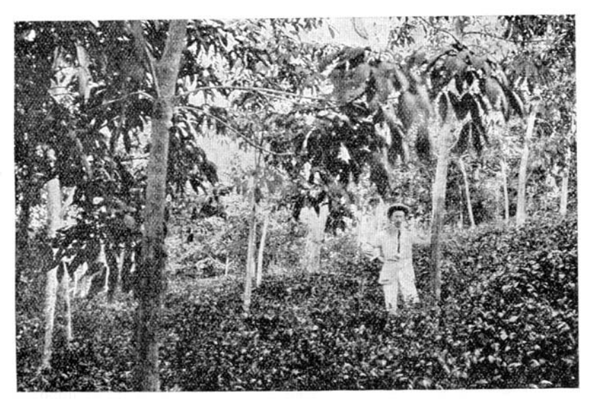
Hevea Rubber and Tea

To make the book suitable to as wide a circle of readers as possible the author has aimed at combining an accurate account of the scientific side of