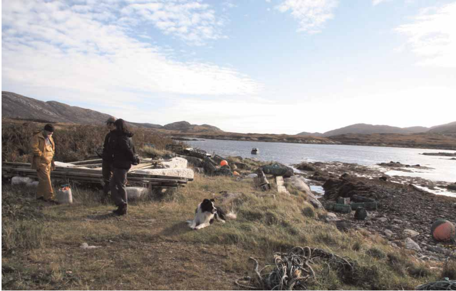
Figure 3. Public engagement and community outreach has led to the discovery of numerous underwater prehistoric sites throughout Europe. Although shipwrecks may be the most intuitive and obvious example that people associate with underwater archaeology, community engagement is important for understanding local environments, preservation potential and for sharing information about chance finds (which can, in turn, lead to the discovery of in situ deposits).