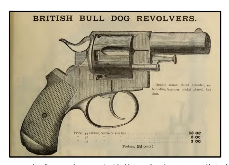
Figure 1. British Bull Dog Revolver (c. 1889), a "double-action" revolver.