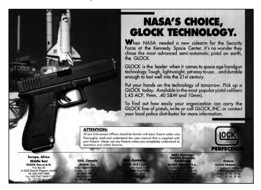
Figure 2. Glock strongly emphasized new technology in its marketing. In this 1993 advertisement, it trumpets its association with the Kennedy Space Center to portray its semi-automatic handgun as advanced.

used it to make this ad," meaning, to make the bullet holes in the advertisement. In other words, police under threat could rely on the Glock to shoot.<sup>24</sup>