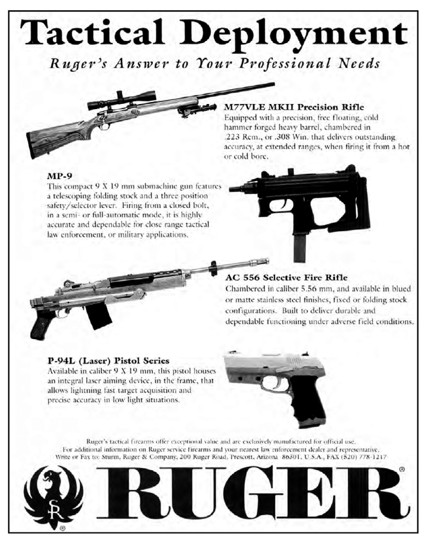
Figure 4. Like Beretta, Ruger offered a range of weapons to police, including semi-automatic handguns, sniper rifles, and fully automatic rifles, as "tactical" weapons.

automatic pistols often had more recoil than .38 calibre revolvers, were more difficult to operate, and could not be handled easily by small or weak-wristed officers.