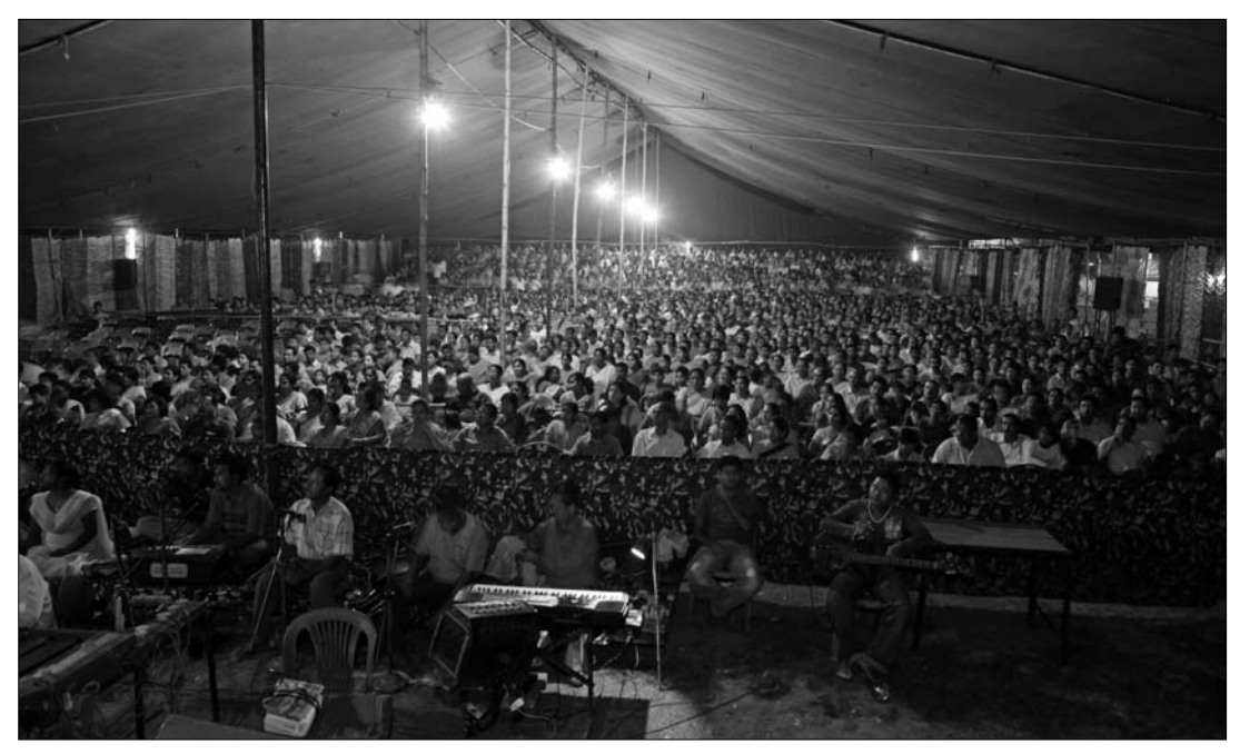
Above: the audience at a mobile theatre production. Below: cross-section in close-up.

production in 2015–16 concerning a generational conflict. Chokrobehu (which can be roughly translated as 'a tightening net') tells the story of a young man who wants to marry a pretty girl from his village. He (and the tightly packed audience in the tent) do not at first understand why his father is so vehemently opposed to this alliance, since the girl seems to possess all the virtues of a wife. But the audience guesses that something is not right, thanks to the disconcerting flashbacks – fragments of memory that come