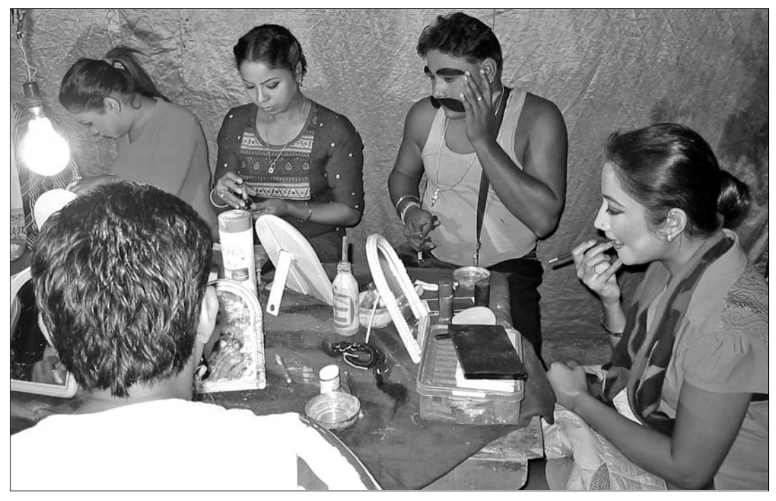
The cast of Crazy Krishna in the green room.

ence with this aspect of its own world is intensely emotional, yet it is also conducive to developing greater awareness of the problems. Even though the subjects addressed are serious, the music and effects make for an entertaining evening. The audience experiences a story that could have happened in their village here and today, but in a form that amazes them.