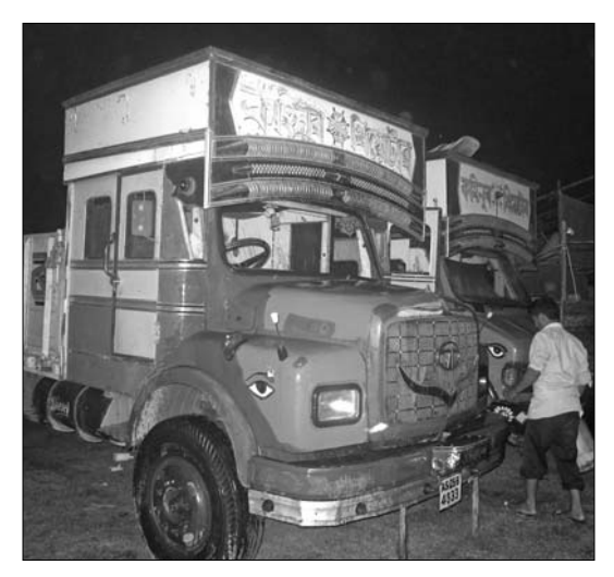
Above: trucks being prepared to transport a mobile theatre.

The mobile theatre companies are invited by the Raasleela organizing committee, Raas leela being the traditional dramatic portrayal of the life of Lord Krishna and comprising songs as well as spoken passages. It is Assam's most important theatre festival,