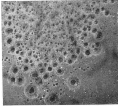
Fig. 1. Photograph of the edge of a plate spread with pus from a "pyogenic virus" lesion after 10 days' incubation. The L 4 colonies have grown up between the pus cells. \times 80 .