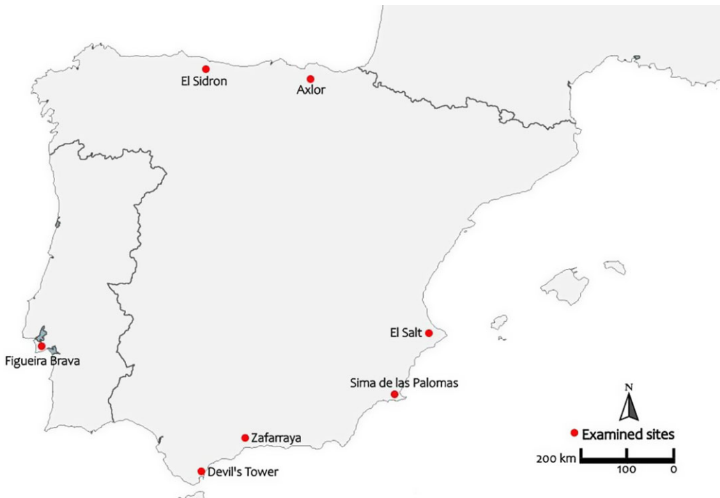
Figure 1. Geographic determination of the examined sites.

methods during the fieldwork has prevented a precise temporal specification of the findings, but a conventional one between 130 and 30 kya (Bokelmann et al 2019). The human remains at the site consist of a cranium and a mandible, which are attributed to a Neanderthal male child. Inside this context, the analysis of Lalueza-Fox and Pérez-Pérez (1993) focused on the buccal surfaces of the deciduous molars, aiming to extract pieces of information regarding dietary proxies.