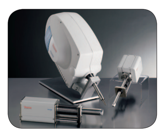
Thermo Scientific EDS, WDS and EBSD The optimal integration of detectors, analyzer and software for all your microanalysis needs.