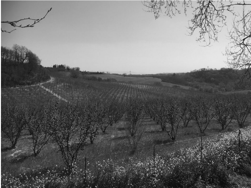
Figure 11.1 Typical landscape in the Viterbo farming system.

last decade featured a soaring market demand for hazelnuts, while other crops' profitability levels plunged, leading to a significant spreading of the perennial cultivation in the surrounding areas, historically excluded (Nera et al., 2020). Furthermore, substantial modernisation led to growing specialisation and mechanisation levels in the hazelnut sector, with the confectionery industry asking for higher quality standards, fomenting irrigation systems, and chemical treatments. Simultaneously, irrigation ensures larger kernels, and agro-chemicals allow for higher quality levels and lower defects caused by insects (both on taste and appearance). The importance of chemical products for ensuring profitable campaigns hampers the development of organic farming, which represents less than 10 per cent of the whole production.