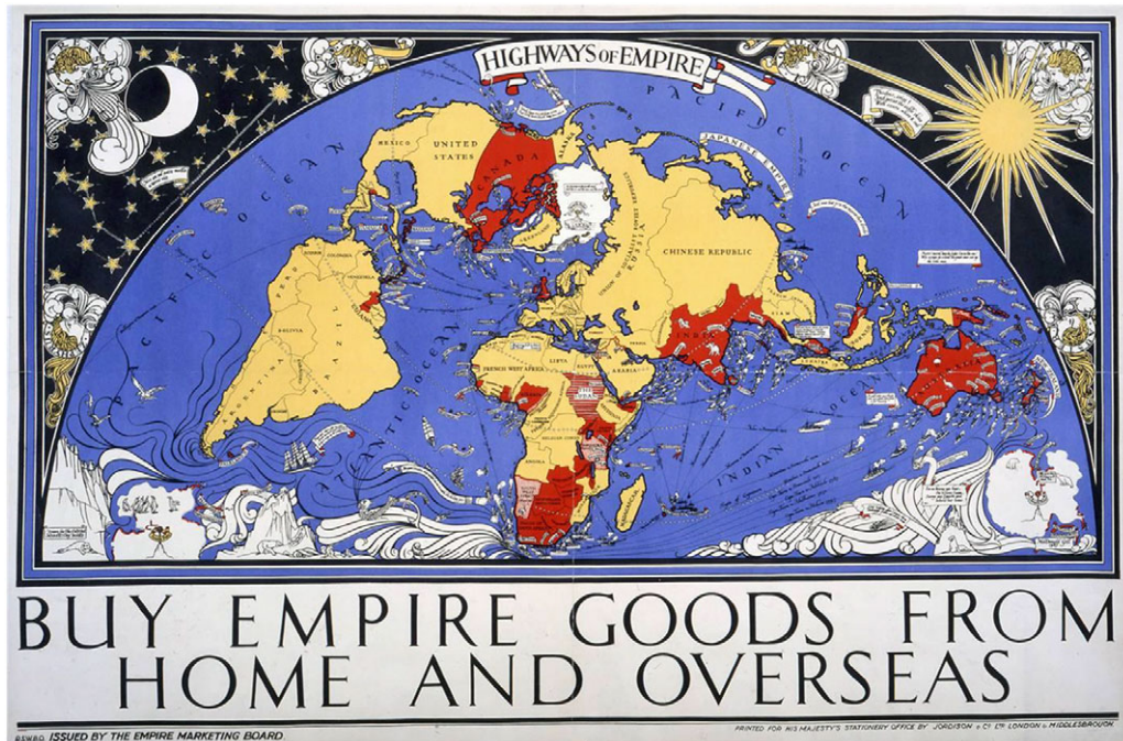
Figure 2: An Empire Marketing Board Advertising Poster, ca. 1927.