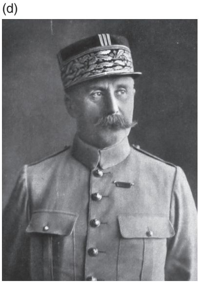
Fig. 17 One Allied and three French Commanders-in-Chief