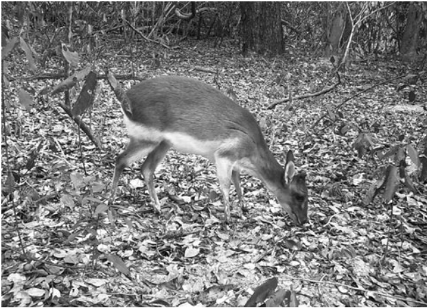
PLATE 1 Aders' duiker photographed on 26 September 2008 in the Boni National Reserve (Fig. 1).

obtained on local names for blue duiker Cephalophus monticola or bush duiker Sylvicapra grimmia .