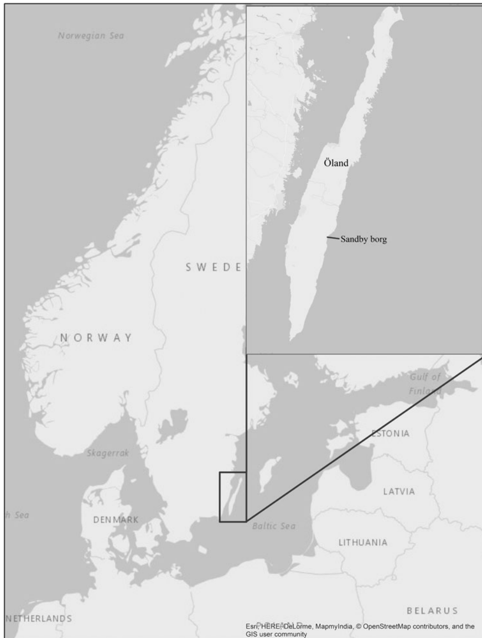
Figure 1. Scandinavia, with Öland and Sandby borg indicated. (Basemap © OpenStreetMap contributors, modified by Helena Victor.)

the early and middle Iron Age (Table 1), several ringforts were erected on the island; the remains of 16 are still visible today (Wegraeus 1976). Several Öland ringforts, Sandby borg included, were seemingly used as fortified villages, with houses enclosed by a high circular limestone wall (Fig. 2; Skarin-Frykman 1967; Stenberger 1933; Wegraeus 1976). There is no consensus regarding whether the ringforts were