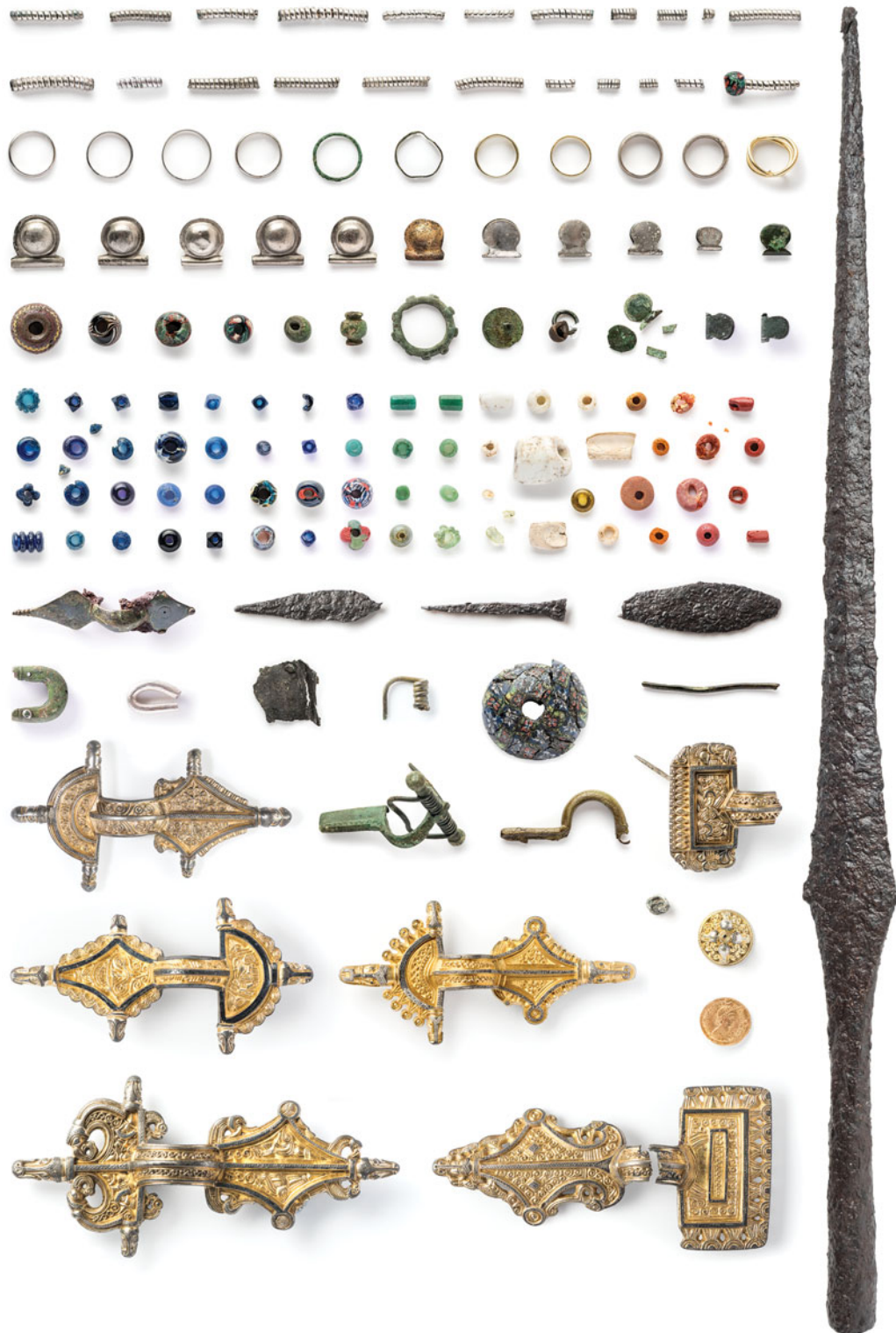
Figure 3. A selection of valuable artefacts encountered in Sandby borg, including relief brooches, glass beads, silver and gold finger rings, solidi and silver pendants.