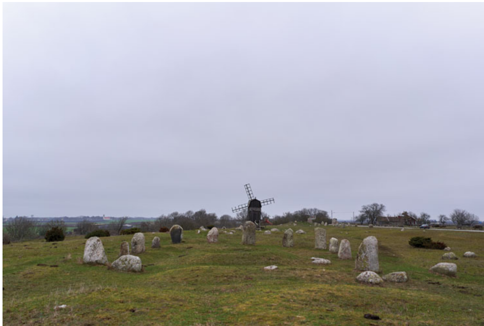
Figure 5. Gettlinge grave field, one of many Öland Iron Age grave fields with standing stones still visible today.

the hearth while the hearth was still smouldering, and that his body was not moved thereafter (Alfsgöter et al. 2018; Pappmehl-Dufay & Alfsgöter 2016). The trauma pattern indicates that the victims were killed in an efficient manner, with a minimal amount of force (that is to say, with a few lethal blows, often directed to the cranium). There are no signs of excessive violence, i.e. mutilation (Alfsgöter & Kjellström 2018). No defence injuries have been encountered. The victims seem to have been taken unawares and were ill prepared to defend themselves (Alfsgöter & Kjellström 2018). The attackers were numerous, judging from the repeated pattern of lethal attacks evident in every house excavated so far. The dead bodies were neither heaped together nor buried. There are no indications that human trophies were taken. The minimum number of individuals per area excavated in Sandby borg is extensive and suggests that a majority of the dwellers (maybe all) were killed and left inside the ringfort without mortuary treatment (Victor 2015).