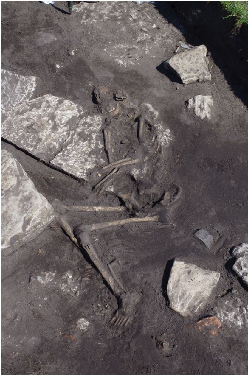
Figure 4. The skeleton of a young teen (ID7) during excavation, one of nine individuals whose remains were exhumed inside house 40.

that have not been subject to osteological sex determination.