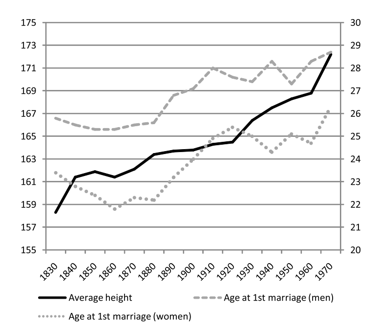
Figure 2. Change over time of the relationship between height and age at first marriage (men and women) in the study area, birth cohorts 1830s–1970s.

Note: The distribution of the number of cases by decade, village and other variables can be found in Table 1.