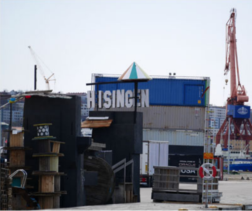
FIGURE 10. 3D adaptations of the HISINGEN sign in Gothenburg, from left to right: a styrofoam sign made by Jesper Hallén and friends for the Lindholmen Street Food Market; Café Fluß, a popular bar and music scene with an air of DIY urban cool.