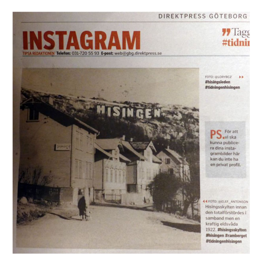
FIGURE 9. The 'original' HISINGEN sign before its destruction in a fire in 1922. Tidningen Hisingen (Facebook), 20 October 2014.<sup>11</sup>

sign in Hollywood and suggesting that HISINGEN was the original, or the 'real thing'. Additionally, several other physical projects around Gothenburg (Figure 10) indicate that, rather than the project dissolving following the Board's denial, HISINGEN now constitutes a source of emanation in itself. In Hallén's words, the HISINGEN sign 'does not have to exist, to exist'. With each new sign inspired by HISINGEN contributing to its enregisterement on a local scale, as well as citing and simultaneously warping the 'original' in Los Angeles, the interdiscursive circulation of HOLLYWOOD is thus shown to have a long reach indeed. Contrary to most other place-name-based citations of the source sign that we have examined, the social life of HISINGEN relies heavily on its mediatization and it still NOT being erected in its proposed place. This subversive context has led to the sign's enregisterment as a locally signifying language object, its value circulating through citations in physical, digital, and mobile emplacements.