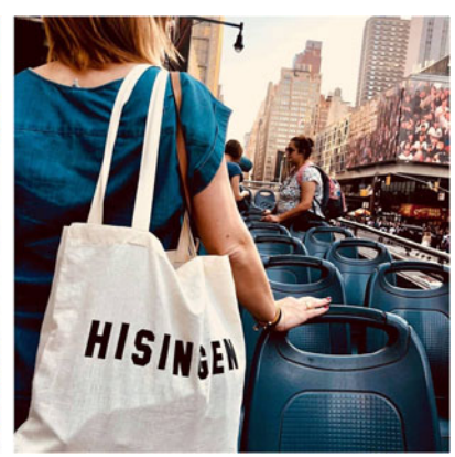
FIGURE 8. The HISINGEN sign printed on T-shirts for sale at a Hisingen market, on a tote bag in New York, tattooed on a woman's arm, and as huge letter objects being transported by helicopters.<sup>10</sup>