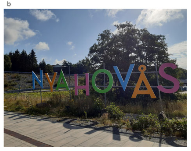
FIGURE 6. a. One of the first signs of the exploitation of Nya Hovås: a ritual act of possession, February 2017; b. The colored NYA HOVÅS sign in August 2021.