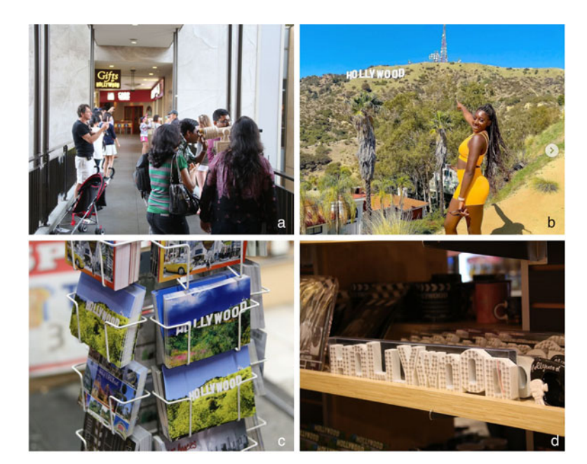
FIGURE 3. a. Viewing and taking photos with the HOLLYWOOD sign at the Hollywood and Highland Center Mall, Los Angeles, in 2013; b. Hiking up to see the HOLLYWOOD sign. Instagram post with user's identity redacted; screen grabbed 6 March 2021; c. HOLLYWOOD postcards at the Hollywood and Highland Center Mall, Los Angeles, 2013; d. HOLLYWOOD word-object souvenirs at the Hollywood and Highland Center Mall, Los Angeles, 2013.

enregistered qualia that support its widespread legibility in global social space. In this, HOLLYWOOD is perhaps merely the most widely recognized among many signs that have been shown to be enregistered within a given context (e.g. Järlehed 2015; Jaworski 2015; Järlehed & Fanni 2022; Zhou 2023). In each case, indexical coherence is achieved through the combination of qualia, or 'bundling': the 'factor of co-presence' that is inherent to all material things (Keane 2003:414), and which 'binds' meaning (e.g. fame ) to a material object (e.g. the HOLLYWOOD sign) and to the different semiotic features that constitute that object.