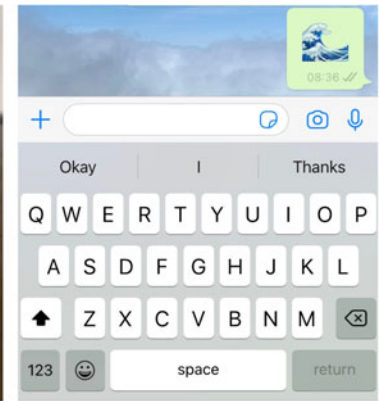
FIGURE 2. Three citations of Hokusai's Great Wave, from left to right: a coffee shop in suburban Hong Kong; a pair of socks for sale in New York City; the wave emoji on WhatsApp.