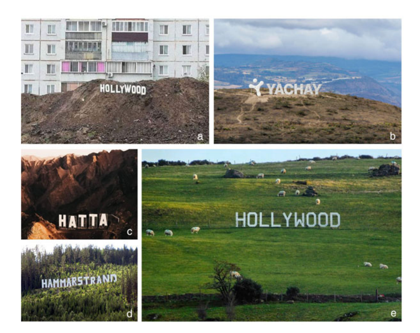
FIGURE 1. a. 'Eastern Europeans have their own Hollywood sign'. Reddit, 5 October 2018; b. The YACHAY TECH sign in Ecuador. 27 January 2014, Agencia de Noticias ANDES, Creative Commons 2.0; c. The HATTA sign in Dubai Emirate, United Arab Emirates. Instagram post by @destinationmydubai; d. The HAMMARSTRAND sign in Ragunda Municipality, Sweden. 22 June 2011, Petey21, Creative Commons 1.0; e. The HOLLYWOOD sign in County Wicklow, Ireland. Instagram post by Visit Wicklow (@visitwicklow).¹

historical, cultural, and socioeconomic context. But why is this process of enregisterment and citation being produced, and how is it achieved? What are the contextual and material affordances and constraints for these localized citational processes, and how do they affect the enregisterment of the HOLLYWOOD sign as a global emblem? When, if ever, is the process of emanation coming to an end, and we can no longer talk about HOLLYWOOD ?