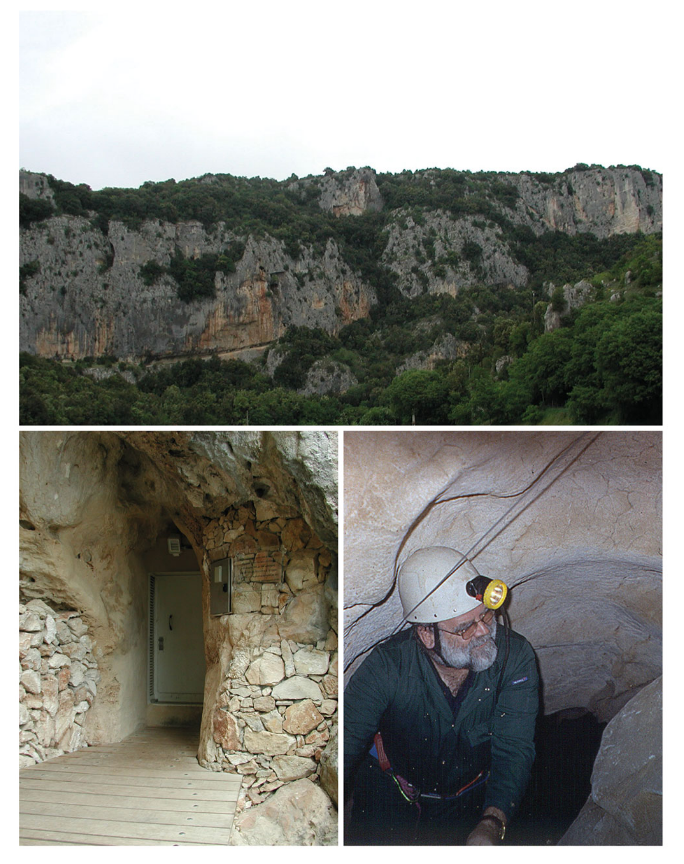
Figure 1. Chauvet Cave, France. (Top) the cliff within which the entrance to Chauvet Cave is concealed (Photograph: Iain Davidson); (lower left) built entrance to cave with security devices (Photograph: Iain Davidson); (lower right) the author descending the ladder into the cave (Photograph: Jean Clottes).