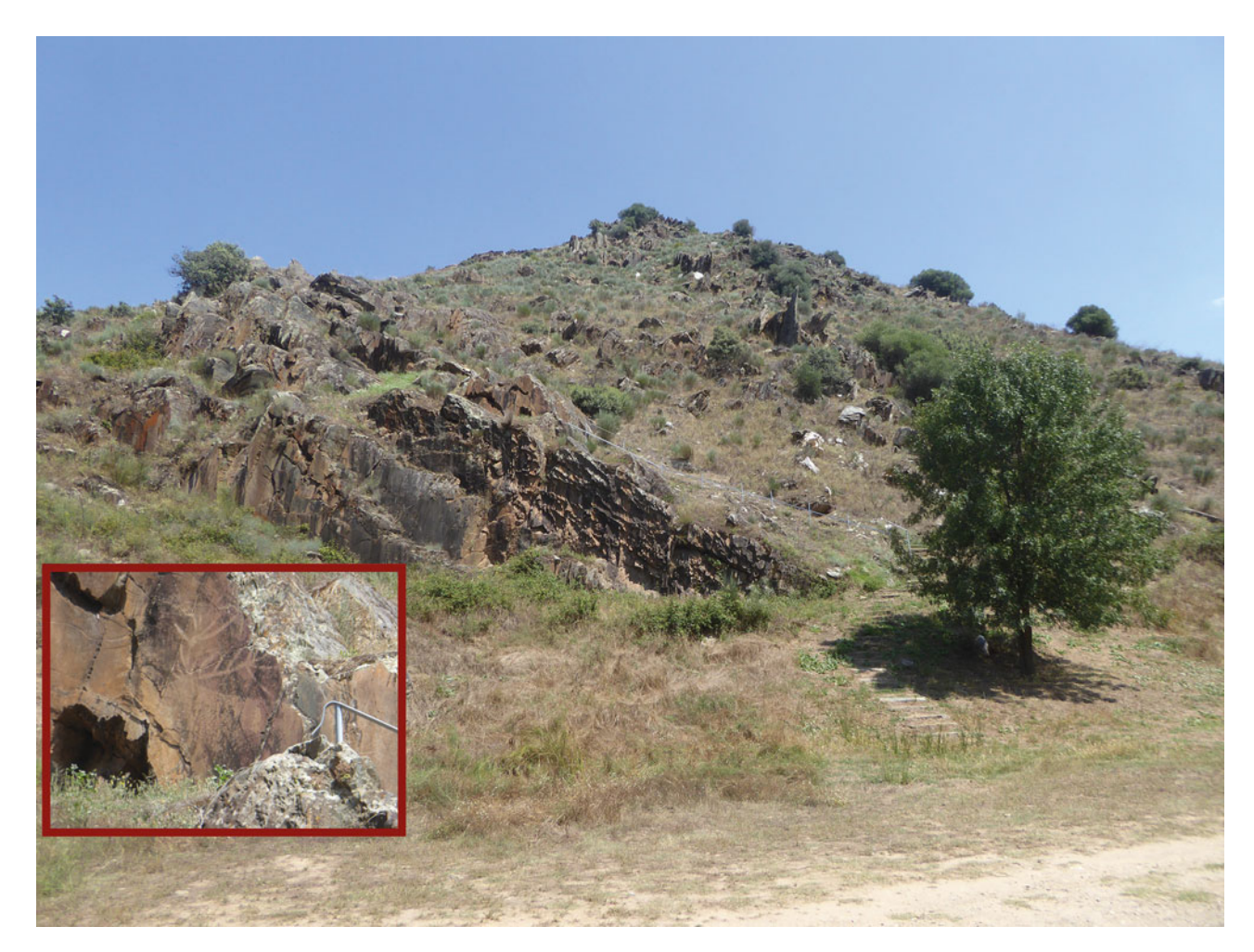
Figure 2. Pensacosa, in the Côa Valley, Portugal. Large deer in context. The deer is on a panel in the middle of the photo, at the top of the walkway protected by a handrail. The top of the handrail and the image of the deer can be seen in the inset at the bottom left of the figure.

what led to the patterning of rock art there. One approach would be to seek an explanation which would make each region ('Nation' in Ross's title) like the others; another would be to suggest that the patterns of change varied between regions, just as they do now. It is too easy for archaeologists to imagine that it is better to smooth over differences and avoid different regional outcomes.