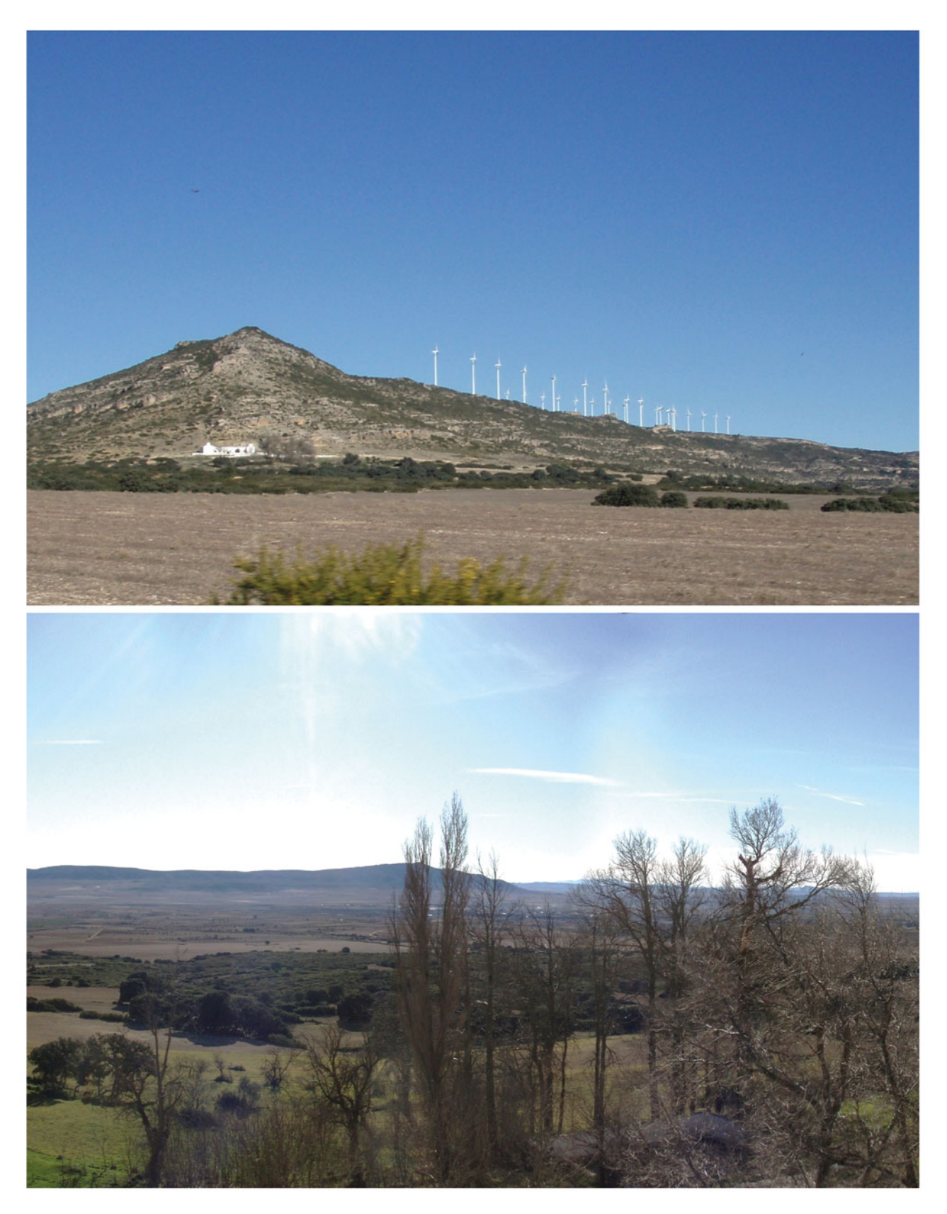
Figure 3. Cueva de la Vieja, Alpera, Iberia. (Top) view towards the cave which is a little to the right above the white farm building (Photograph: Iain Davidson); (bottom) view from the cave showing the extensive plain in front of it (Photograph: Iain Davidson). 644