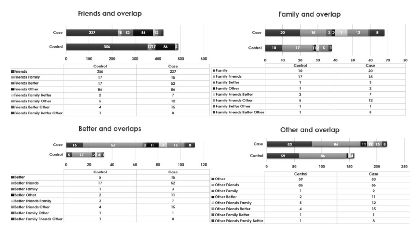
Figure 1. Overlapping reported RFUC in cases and controls.